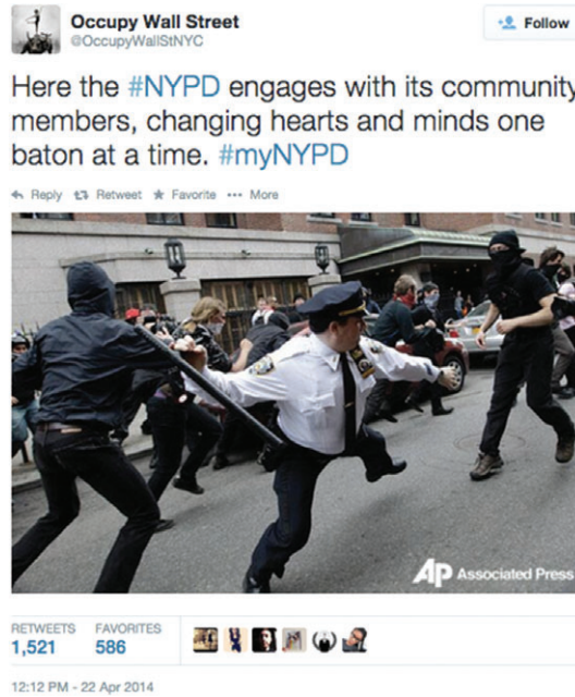
Figure 2 Example of a hijacked #myNYPD tweet, in this case Occupy Wall Street (@Occupy-WallStNYC) using sarcasm alongside an image of police violence.

power, access, and social identity in defining the public and civil society (e.g., Asen & Brouwer, 2001; Black Public Sphere Collective, 1995; Dean, 1992; Goodnight, 1997; Hauser, 1998; Jackson, 2014; Squires, 2002).