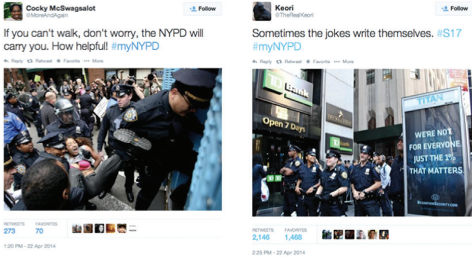
Figure 5 Examples of counterpublic tweets that use sarcasm (left) and snark (right) as discursive strategies.