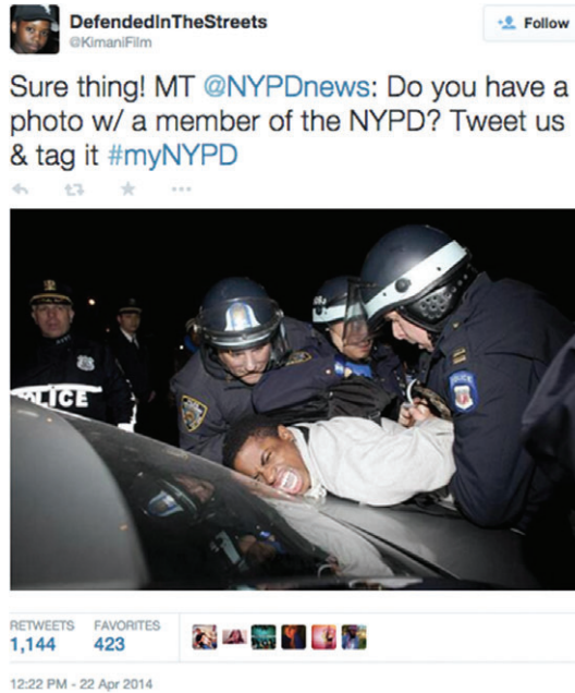
Figure 4 Hijacked tweet by @KimaniFilm retweeting the NYPD's (@NYPDNews) request for photos with a counternarrative image.

#myNYPD retweeted @NYPDNews' initial request before launching into hours (and days) of tweeting with #myNYPD. For example, the above tweet from @KimaniFilm, a Twitter account run by a diverse set of filmmakers behind a documentary about Kimani Gray, a teenager shot and killed by the NYPD in 2013, was retweeted over 1,100 times (Figure 4).