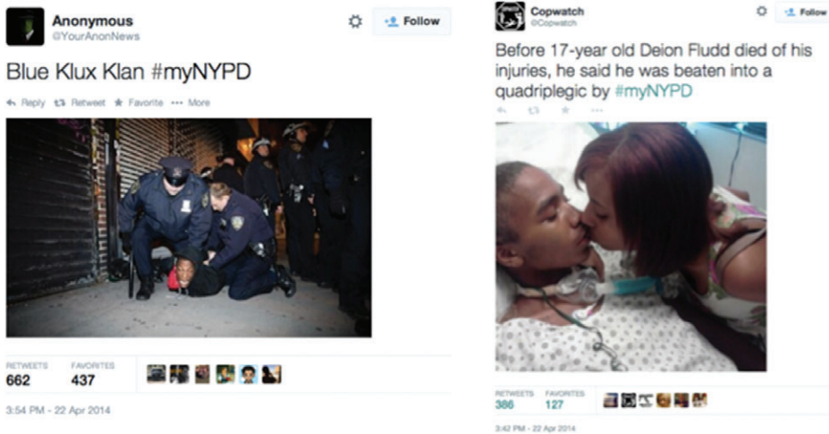
Figure 6 Examples of counterpublic tweets that use hyperbole (left) and outrage (right) as discursive strategies.

Furthermore, although images that accompanied satirical #myNYPD tweets often showed the victims of police violence to be people of color without naming this phenomenon, those that focused on constructing outrage openly called the NYPD racist. For example, @Copwatch tweeted that “#myNYPD is racist, no matter what color the officers are,” and @YourAnonNews offered a “Fuck you, #myNYPD” to what they described as “violent, racist police oppression.”