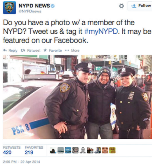
Figure 1 The original #myNYPD tweet, issued by @NYPDNews on 22 April 2014.

Herein, we explore the hijacking of #myNYPD using counterpublic sphere theory as a guiding framework to examine how Twitter is used as a platform to organize, generate, and promote counterpublic narratives. We offer a theoretical framework for networked counterpublics, arguing that this hijacking, and online and offline response to it, illustrates the democratizing potential of Twitter and the evolving strategies of citizen activists in the age of new media. Through a combination of large-scale network analysis and qualitative discourse analysis, we offer insight into emergent counterpublic structure and leadership, the discursive strategies deployed by crowdsourced elites within communities of resistance, and the reception of networked counterpublic activism in the mainstream media. We conclude with implications for understanding the evolving nature of counterpublics and collective action in the second decade of the 21st century.