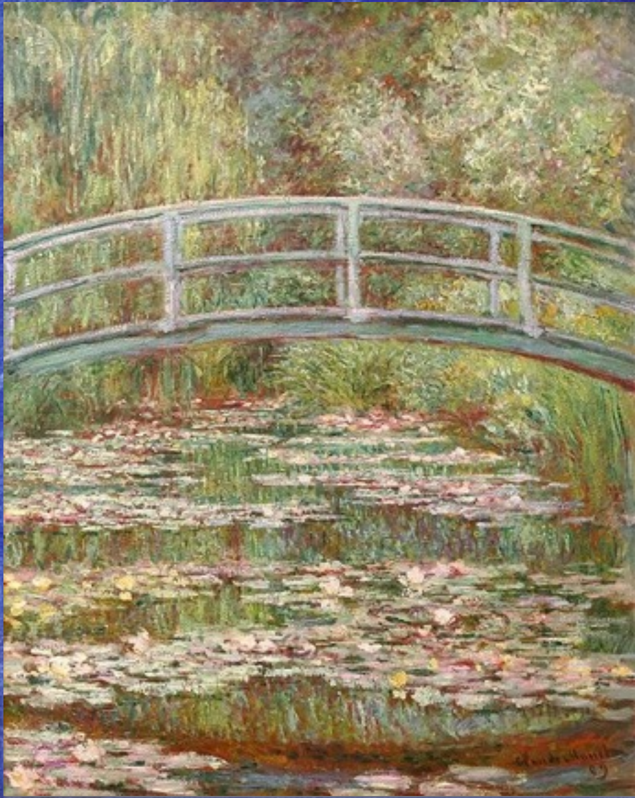
BRIDGE OVER A POND OF WATER LILIES (1899)