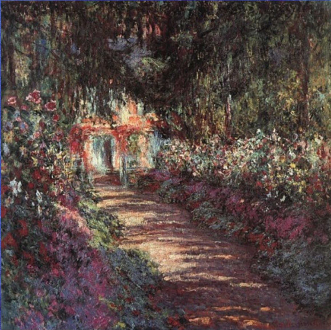
THE GARDEN IN FLOWER (1900)

MONET LIKED TO PAINT “CONTROLLED NATURE”. HE INVESTED MUCH TIME AND MONEY INTO HIS PROPERTY AND GARDENS, CREATING SPECIFIC SCENES FOR HIMSELF TO PAINT OVER AND OVER AGAIN. AS HE BECAME MORE SUCCESSFUL, HE HIRED A CREW OF SEVEN GARDENERS.