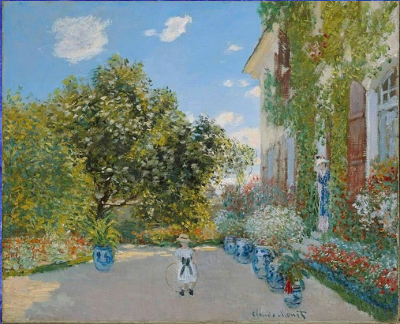
THE ARTIST'S HOUSE AT ARGENTEUIL (1873)