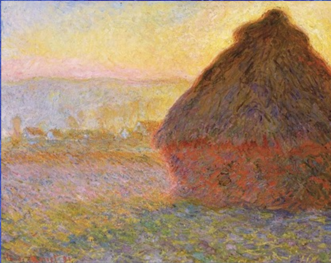
HAYSTACKS, SUNSET (1890-91)

SPENT MUCH OF THE REST OF HIS LIFE PAINTING IN AND AROUND HIS PROPERTY IN GIVERNY, FRANCE.