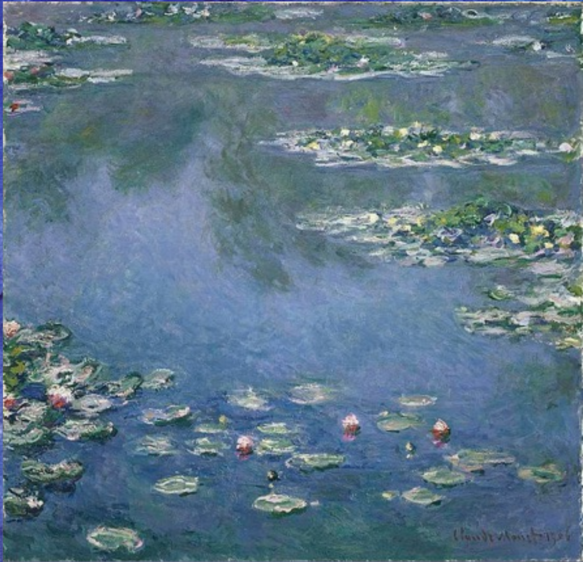
WATER LILIES (1906)