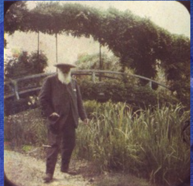
THE ARTIST IN FRONT OF THE ACTUAL BRIDGE (1917)