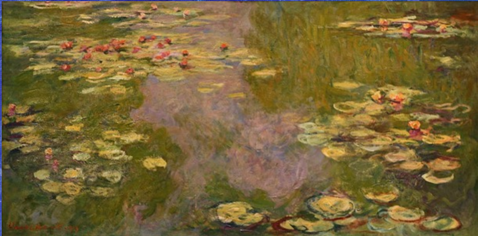
WATER LILIES (1920-26)