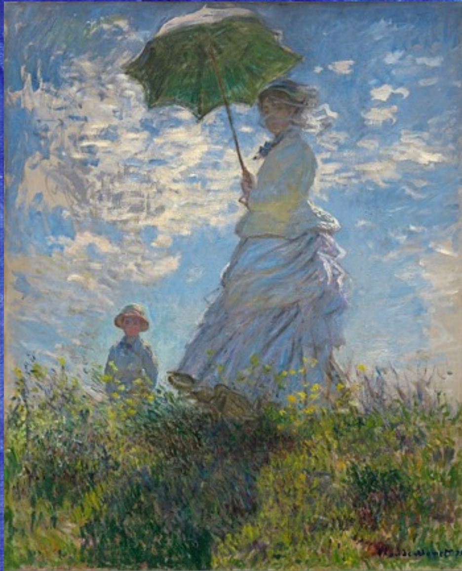
WOMAN WITH A PARASOL (1875) (THE ARTIST'S WIFE AND SON)