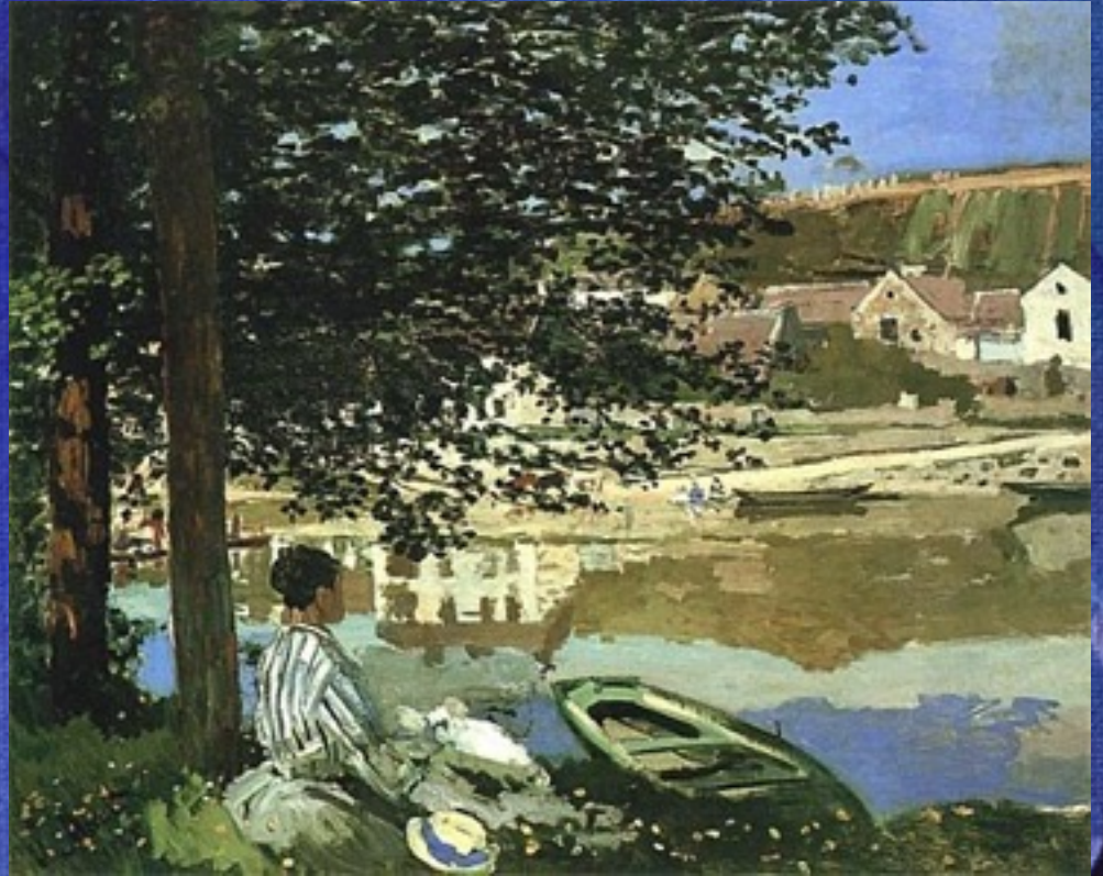
ON THE BANK OF THE SEINE, BENNECOURT (1868)

WHEN MONET VISITED THE LOUVRE IN PARIS, HE SAW OTHER ART STUDENTS COPYING THE PAINTINGS OF THE MASTERS. MONET SAT AT THE WINDOW AND PAINTED WHAT HE SAW OUTSIDE.