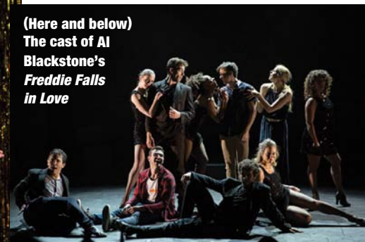
(Here and below) The cast of Al Blackstone's Freddie Falls in Love