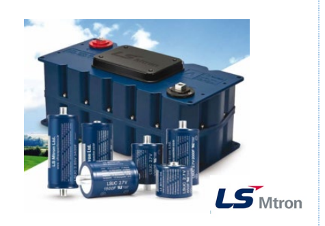
High-Efficiency Low-ESR Ultracapacitors Cells and Modules