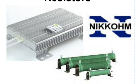
High-Power Resistive Elements and Complete Assemblies