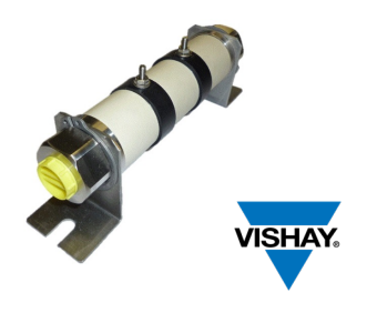
For Rapid High Energy Discharge