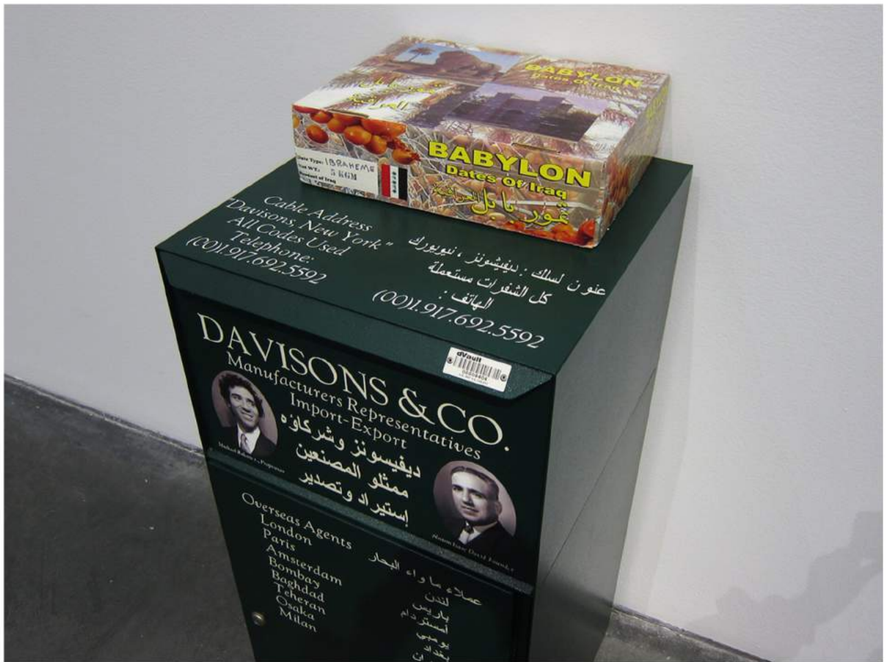
Installation view of 'Michael Rakowitz: Backstroke of the West' at MCA Chicago