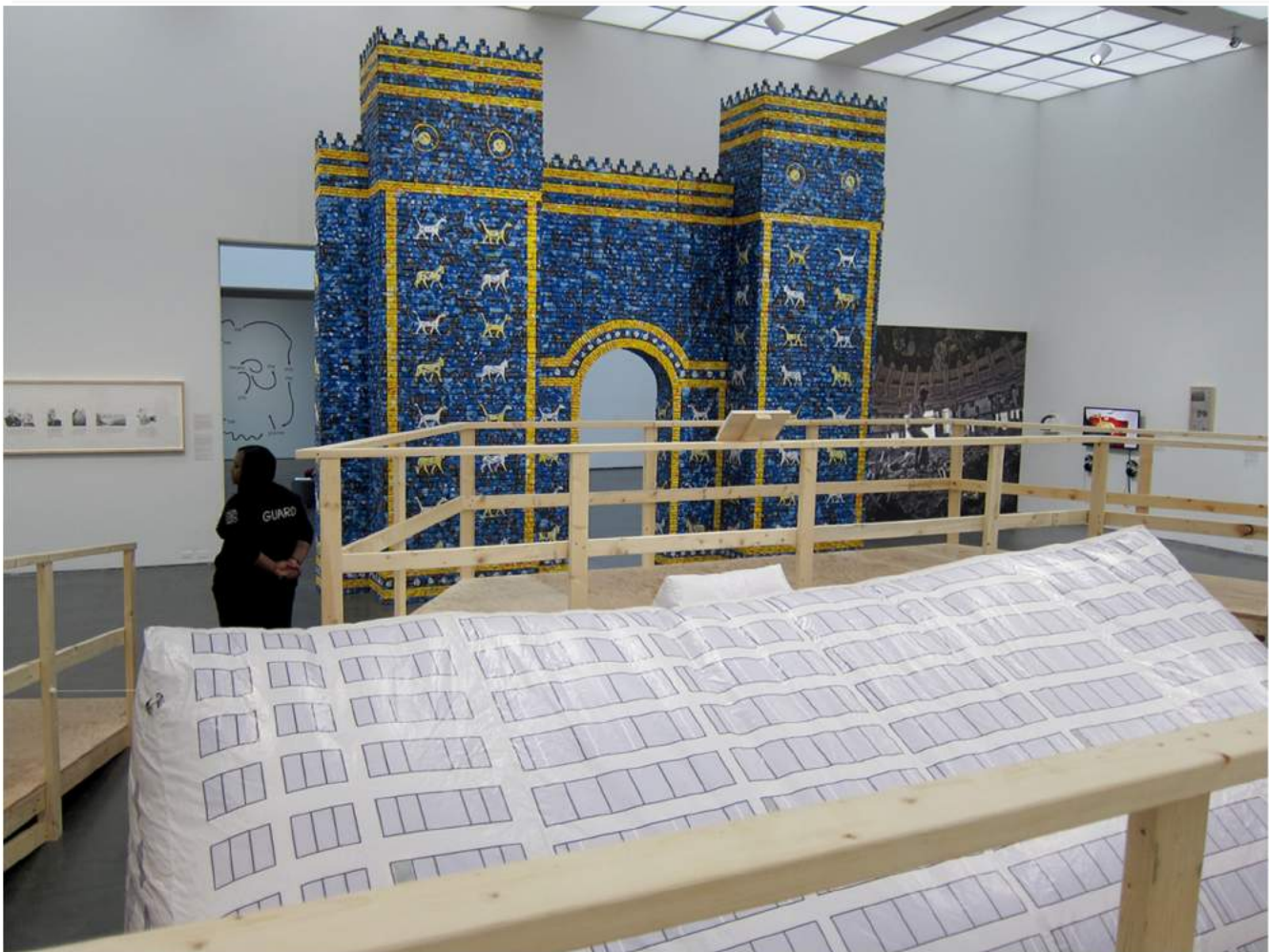
Installation view of 'Michael Rakowitz: Backstroke of the West' at the Museum of Contemporary Art, Chicago