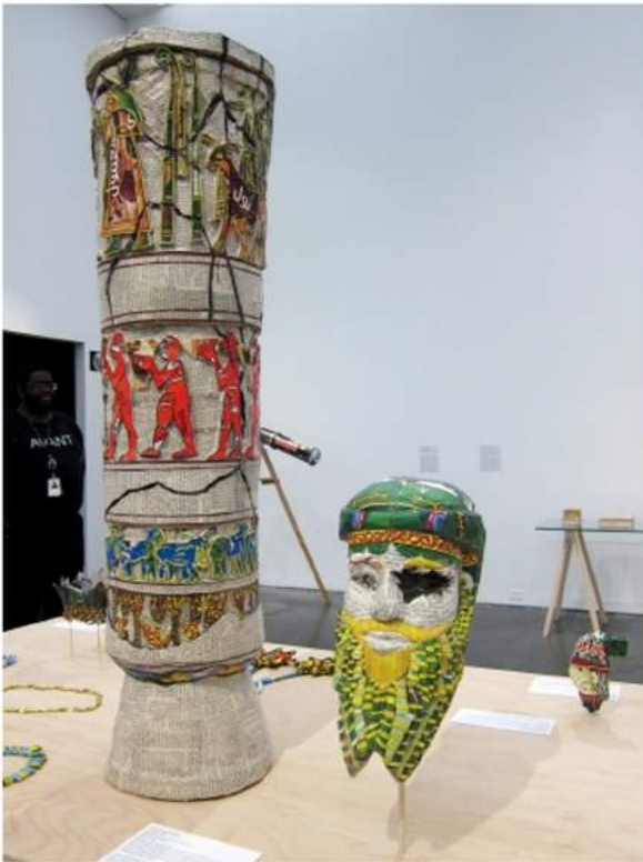
Works from "The invisible enemy should not exist" (2007-ongoing)