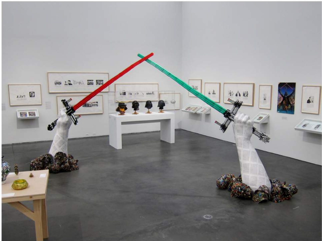
Installation view of 'Michael Rakowitz: Backstroke of the West' at MCA Chicago

Michael Rakowitz: Backstroke of the West continues at the Museum of Contemporary Art, Chicago (220 East Chicago Avenue, Chicago, IL) through March 4.