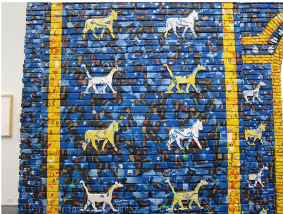
Michael Rakowitz, detail of “May the Arrogant Not Prevail” (2010)

Organized by curator Omar Kholeif, the exhibition includes Rakowitz’s ongoing series, The invisible enemy should not exist , for which the artist and his assistants are fabricating artifacts looted from the Iraqi National Museum in 2003. Each sculpture is made of found detritus such as newspaper and food packaging — material that speaks to an urgency to replace objects that are lost, invisible, even, having been stripped of provenance and placed on the black market. Yet, they assert that history cannot be completely remade. They stand as tragic effigies of treasures forever gone, similar to Rakowitz’s reconstruction of the Ishtar Gate that stands at the exhibition’s entrance, made of plywood and plaster. More accurately, his wooden gate is an imitation of the crude replica that stands in Babylon, commissioned by Saddam Hussein to replace the original — which, again, cannot truly be recreated.