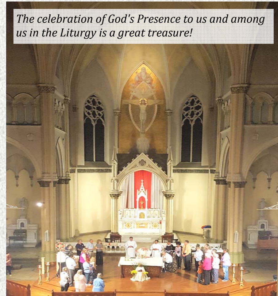
Holy Thursday, 2017

The celebration of God's Presence to us and among us in the Liturgy is a great treasure!