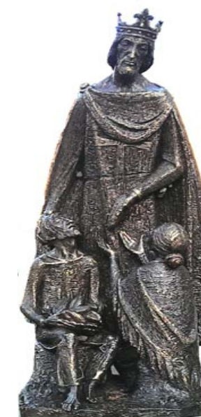
Statue of Saint Louis the King, as displayed on the campus of Little Sisters of the Poor