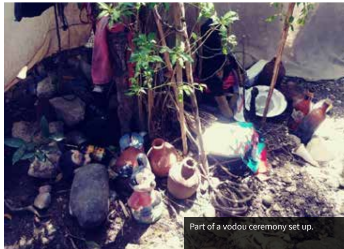
Part of a voodoo ceremony set up.