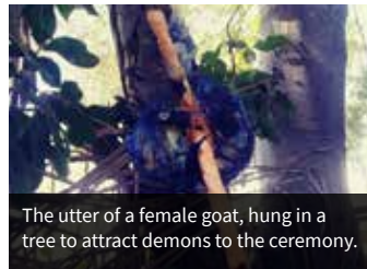
The utter of a female goat, hung in a tree to attract demons to the ceremony.