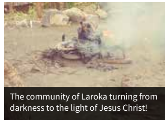
The community of Laroka turning from darkness to the light of Jesus Christ!