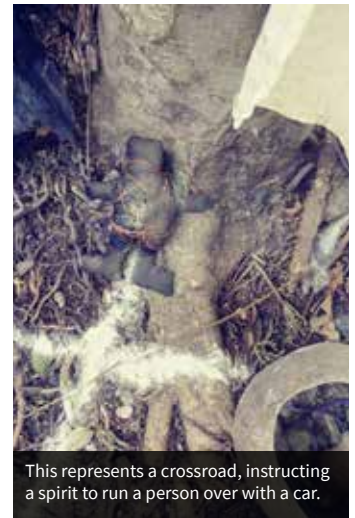
This represents a crossroad, instructing a spirit to run a person over with a car.