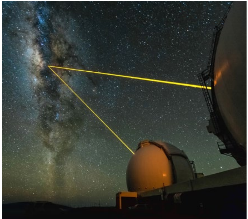
The laser system used to make artificial guide stars that sense the blurring effects of the Earth's atmosphere being used on both Keck I and Keck II during adaptive optics observations of the center of our Galaxy. Next Generation Adaptive Optics would have multiple laser beams for each telescope.

The next generation of adaptive optics could effectively take even the largest earth-bound telescopes “above the atmosphere” and make them truly amazing new windows on the universe. We know how to create this capability—the technology is in hand and the teams are assembled. It is time to put advanced adaptive optics to work.