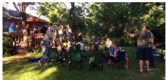
Students, professors and board members started the fall with a cook-out.

Grace and peace this new year! By God's grace, Indianapolis Theological Seminary saw a lot of growth in 2016. As a ministry that depends on the prayers and contributions of churches and individuals across the city, it is my joy to give regular updates on what the Lord is doing. So the following is a brief year-in-review, and will also tell you where the Lord is leading us so far in 2017.