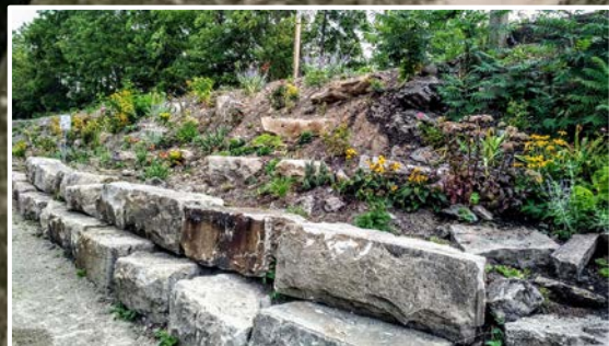
Also featuring a 300 metres of gardens at the entrance, designed by members of the St. Thomas Horticultural Society .