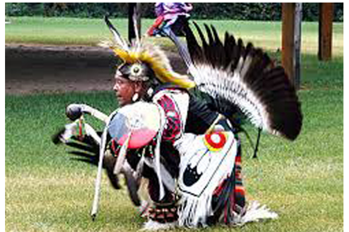
A member of the Pokagon Band of the Potawatomi at a recent Pow Wow