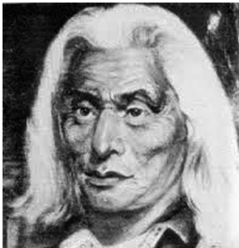
Chief Leopold Pokagon who negotiated to have his Potawatomi Band stay in the St. Joe River Valley