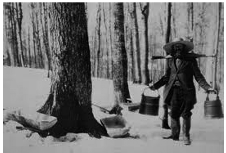
A Maple sap tapper from the days of yore