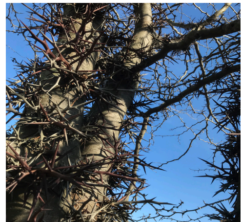
A spiny Hawthorn tree on the south end of IKE property near the third pond. They provide both food and shelter for birds.