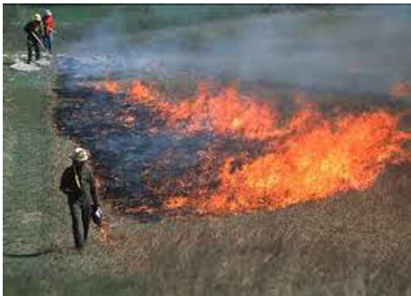
Image of prescribed burn. Done correctly, this method improves natural landscapes, as explained in our March 21st program.