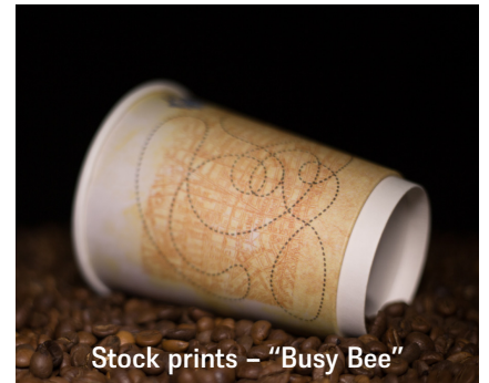
Stock prints – “Busy Bee”