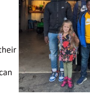
Even though it's been a unique year, our children are going back to school.

Rejoice with us as we now have ten young people who have transitioned from middle school to high school and who desire to live a life of faith. Such an increase is due to the grace of God pouring into their lives. We are God's plows, watering cans, and seed-spreaders. Thank you for partnering with us, so we can reap this harvest together.