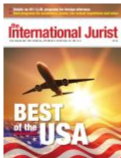
National Jurist International Edition 20116