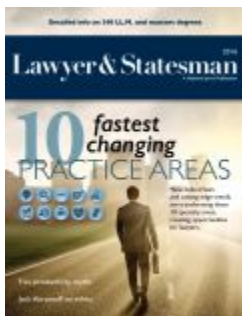
Lawyer & Statesman 2016