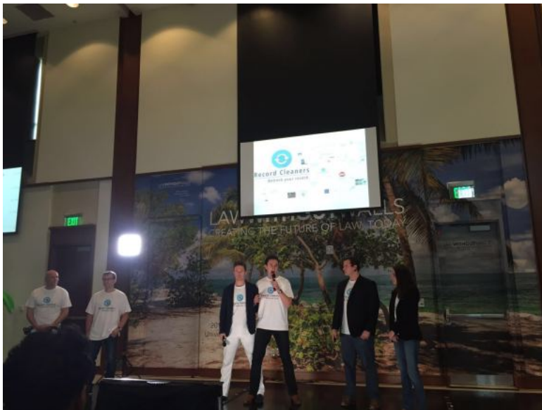
Team "Record Cleaners ((Criminal Records) record cleaners) project delivery moment / 2016., University of Miami

Another project, giving rise to many thoughts of his excellence, was linked to the information technology company IBM and its emerging artificial intelligence systems. The aim of the project - using IBM developed in artificial intelligence systems to create an application that would perform's lawyer-prepared legal documents, analysis of the quality of certain sections and to provide suggestions for improving the way. After this project the students had contact with IBM's artificial intelligence systems developer for further project development.