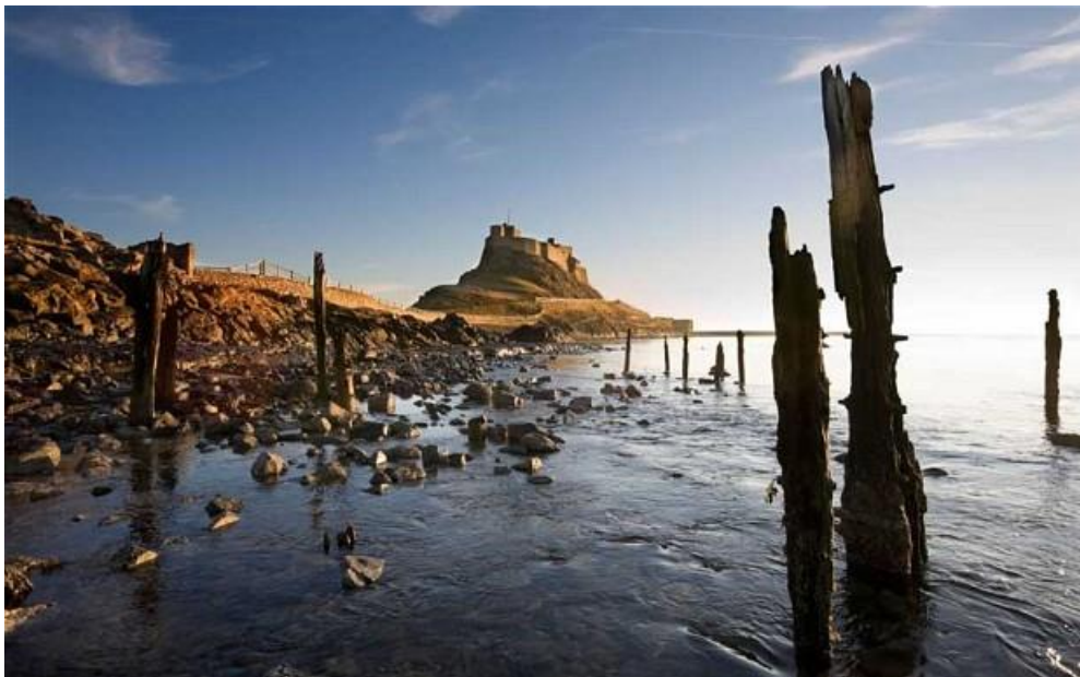
Holy Island of Lindisfarne

During that time we will be meeting to pray with him and explore ideas about spirituality and community together.