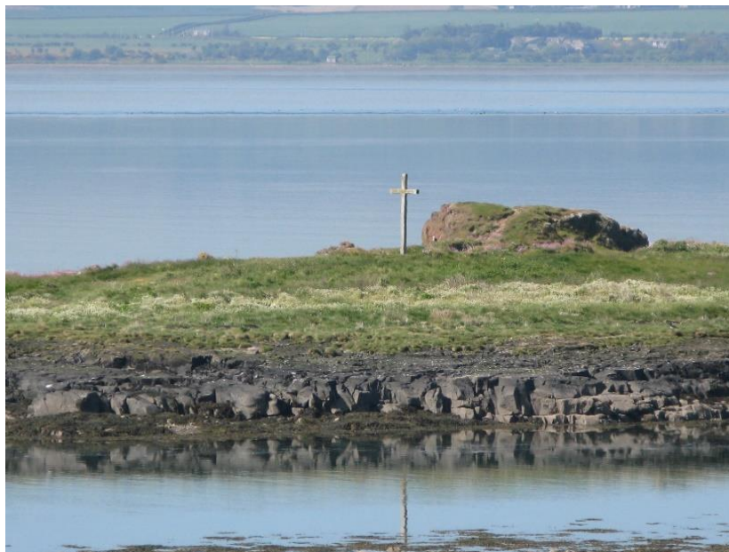
St Cuthbert's Island, Holy Island