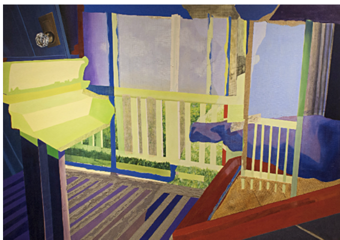
Pleasure-Terror, Sandbox-Screen, 2016

Gallery Hours: Tuesday – Saturday 10:30-5:30