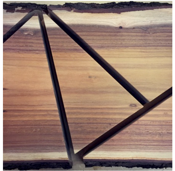
Detail of Triangulation (Good as New) , 2016 Acacia wood and lacquer, 16 in. x 132 in. x 3 in.

Opening Reception: Friday, July 15 th , 6-8:30PM Exhibition Dates: July 15 th – September 2 nd , 2016 Gallery Hours: Tuesday – Saturday 10:30-5:30