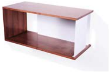
Module: Wall Hung