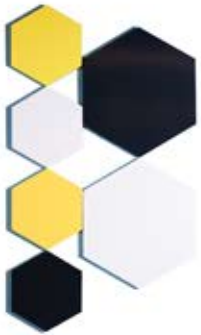
Hang with point up.