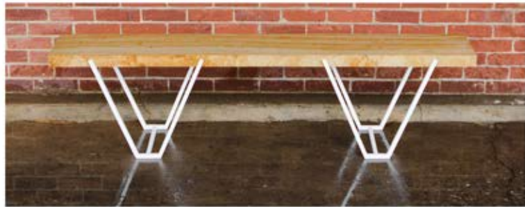
Sandstone Bench MV-015-ST-SAND | 70 L x 13 W x 18 H