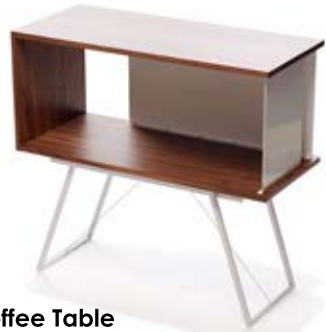
Module: Coffee Table