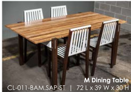
M Dining Table CL-011-BAM.SAP-ST | 72 L x 39 W x 30 H