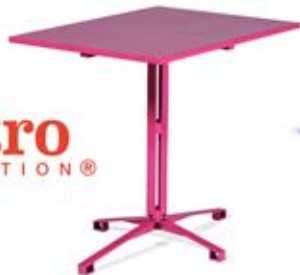
Cafe Table 01 | BT-000-ST | 31 L x 24.5 W x 30 H