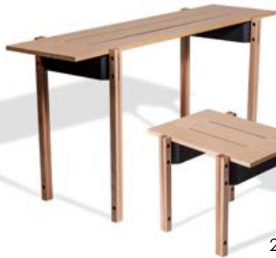
M Console Table CL-009-ASH-ST 60 L x 19 W x 30 H