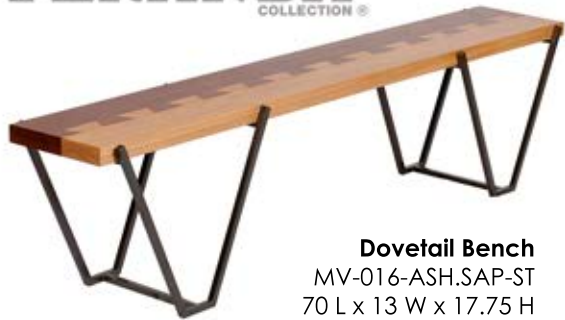
Dovetail Bench MV-016-ASH.SAP-ST 70 L x 13 W x 17.75 H