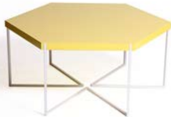
Hex Coffee Table