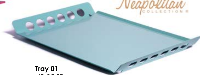
Tray 01 NP-05-ST 21 L x 14.25 W x 2 H