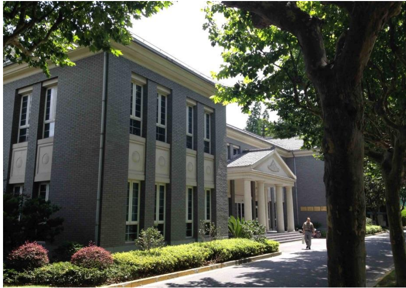
The Nordic Centre building