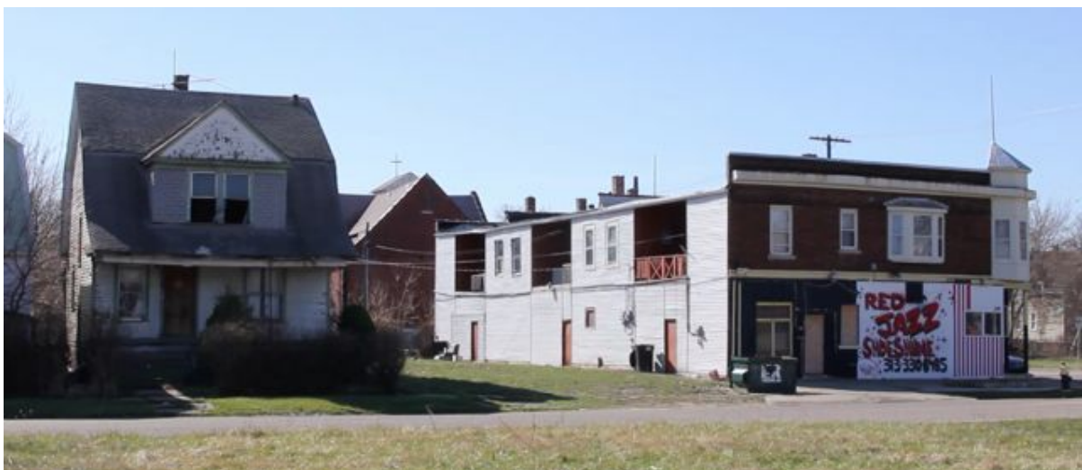
Site of American Riad in the North End neighborhood

Newkirk and Robinson helped pave the way to secure the properties from the Detroit Land Bank Authority: an underused 12-unit, mixed-use building and the grassy lot that will one day be the American Riad courtyard. (Census estimates show that as of 2015, about 35 percent of residences in the North End’s ZIP code were vacant.) Beyond a community arts center, the renovation plans include six affordable housing rentals and commercial space for, according to Ghana ThinkTank’s website, “businesses that serve the needs of the North End, [involving] residents interested in preserving the North End’s history as a black creative corridor.” There’s one business there now, Red Jazz Shoe Shine.