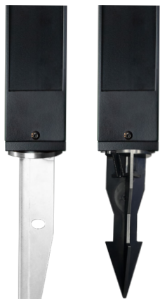
Impaler ABS Stake