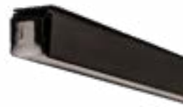
Channel - Standard Part Number: BRI-WAVE-A-SC 1M (3.2') Channel sections 1 - Standard Channel 5 - Screws