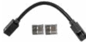
Jumper Connector Kit Part Number: BRI-WAVE-A-JC 1 - Jumper Connector 2 - Metal Covers 2 - Metal Anti-Slip Plates