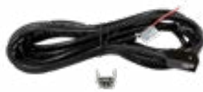
Power Feed Kit Part Number: BRI-WAVE-A-PF 1 - Power Feed w/ Metal Cover 1 - Metal Anti-Slip Plate