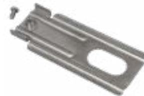
Channel Mounting Plate Part Number: BRI-WAVE-A-MP 1 - Mounting Plate 1 - Screw