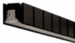
Channel - Bendable Part Number: BRI-WAVE-A-BC 1M (3.2') Channel sections 1 - Bendable Channel 5 - Screws