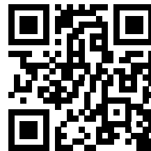
Best Practices Video