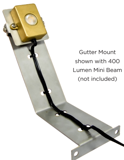
Gutter Mount shown with 400 Lumen Mini Beam (not included)