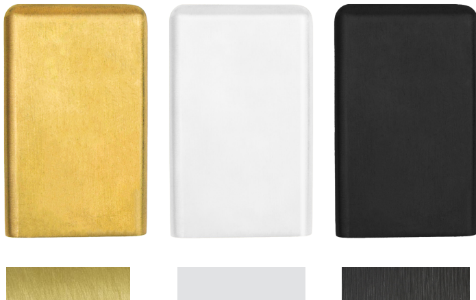
Brass (BR) White (WH) Black Brass (BR-BLK)