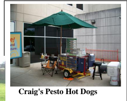
Craig's Pesto Hot Dogs