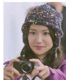
Dir. Yuki Tanada

Japan | 2015 | 97 min | DCP | Japanese w/subtitles