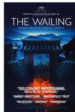
Dir. Na Hong-jin

S. Korea | 2016 | Blu-ray | 156 min. | Korean w/subtitles