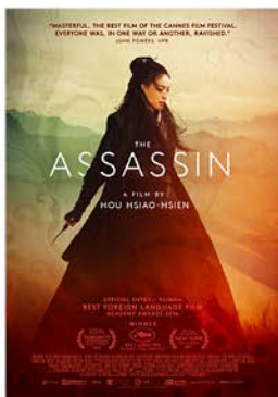
Dir. Hou Hsiao-hsien

Taiwan | 2015 | Blu-ray | 107 min. | Mandarin w/subtitles