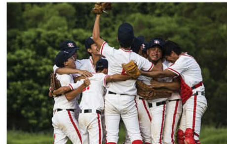
Weeds on Fire