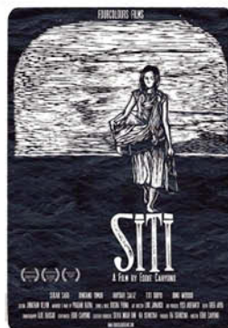
Dir. Eddie Cahyono

Indonesia | 2014 | DCP | 88 min. | B&W | Javanese/Indonesian w/subtitles