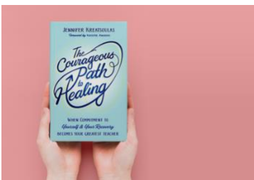
The Courageous Path to Healing Available Now