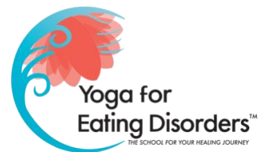
Yoga for Eating Disorders Learn More