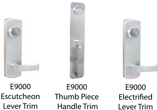
E9000 Escutcheon Lever Trim E9000 Thumb Piece Handle Trim E9000 Electrified Lever Trim