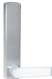
E9100 Escutcheon Lever Trim