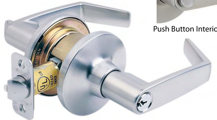
Push Button Interior