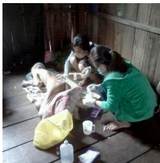
Home visits to the community