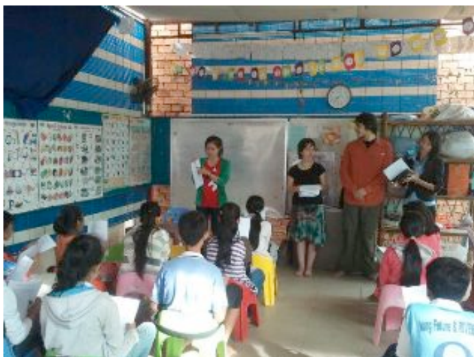
Training students about HIV, domestic and drug use