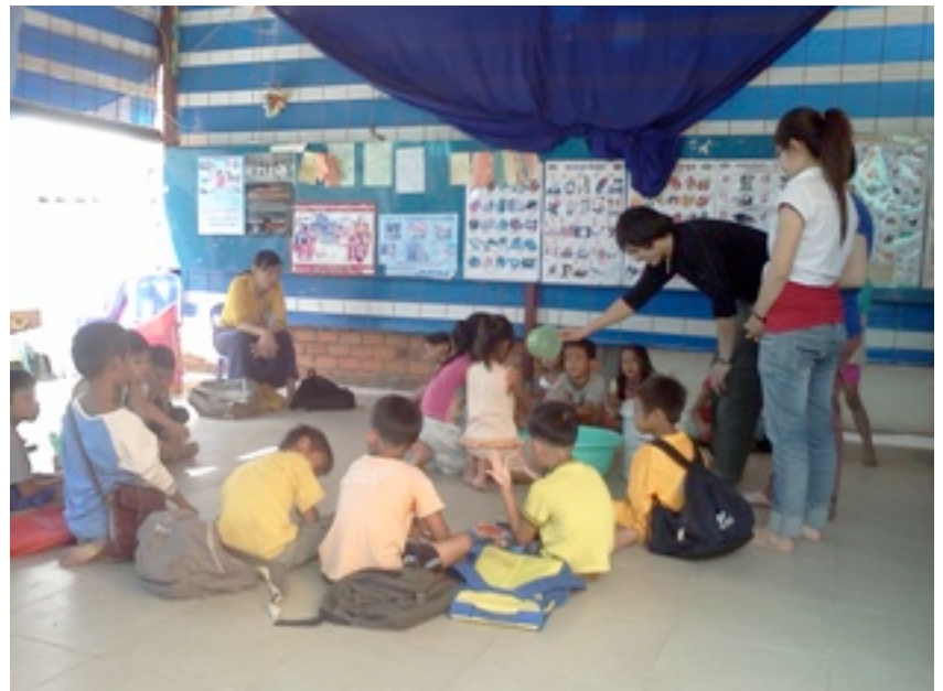
Teaching students how to wash their hands