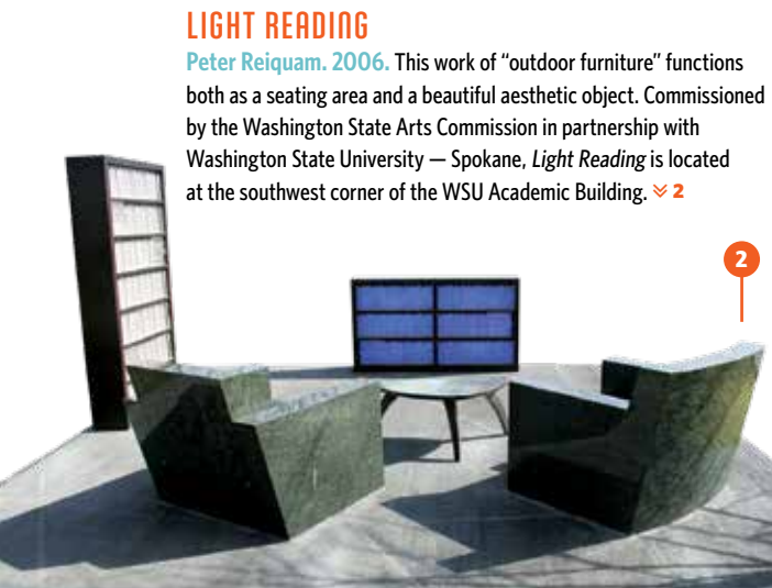
LIGHT READING Peter Reiquam. 2006. This work of "outdoor furniture" functions both as a seating area and a beautiful aesthetic object. Commissioned by the Washington State Arts Commission in partnership with Washington State University — Spokane, Light Reading is located at the southwest corner of the WSU Academic Building. ✕ 2