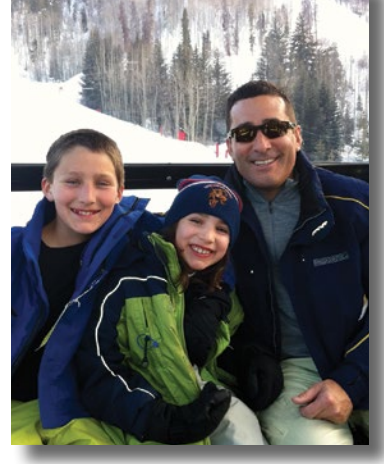
Family Ski Break in Vail and Beaver Creek

Beaver Creek, CO is an absolute delight for those who seek the modern comforts of skiing with a bit of posh. Families can literally ski from village to village and expect fresh chocolate chip cookies slope-side at the end of each day. I personally love the location and