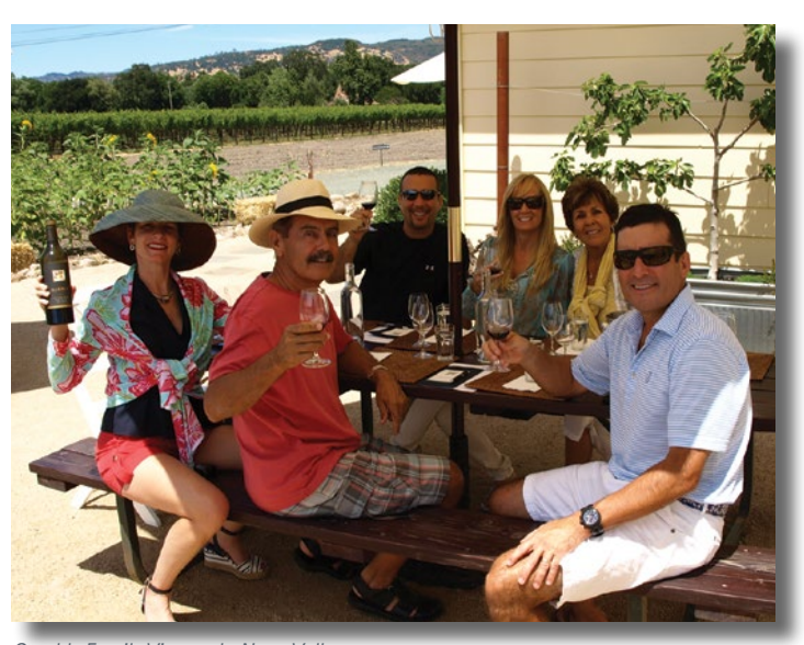
Gamble Family Vineyards, Napa Valley

Any wine country is a treat, but a special way to see Napa Valley is by staying at a couple of fabulous "trailer parks." At the Carneros Inn, all of the sumptuous suites are stand–alone cottages named after their original residents. The grounds are vast and simply beautiful with gardens, trails alongside the vineyards, and at the "Hilltop," a pool seemingly set in the midst of a field overlooking the vineyards of Carneros.