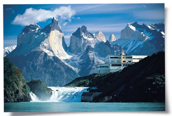
Explora Lodge in Torres del Paine National Park

visit some of Chile's exceptional wine regions. If you do Patagonia, you will want to come back for Atacama and Easter Island — mark my word!