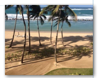
No resort has guest rooms any closer to the beach than The Reserve

The Reserve — the new ultra-luxurious brand within The Ritz-Carlton portfolio at Dorado Beach in Puerto Rico celebrates a bygone era at the site of the former Rockefeller estate. This magnificent resort