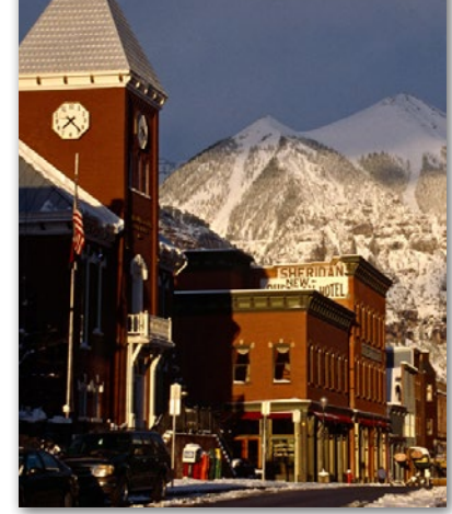
Historic Telluride and the San Juan Mountains

modern lifts and gondolas, unique and varied terrain, breathtaking mountain vistas, and creature comforts such as a ski concierge, well-run kids' ski schools, and a lively après ski scene. While there are several great Western towns in the U.S. Rockies, Telluride is an 1800's mining town with a wholesome organic vibe and 2,000 acres of world-class powder skiing.