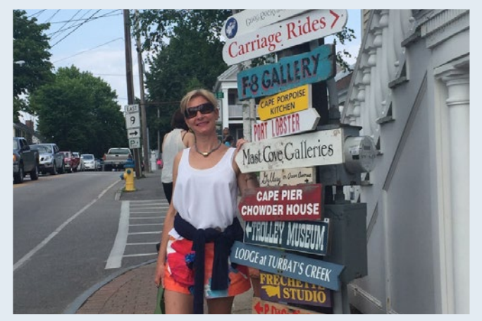
I adore the charming shops, cafés and galleries in Kennebunkport, Maine