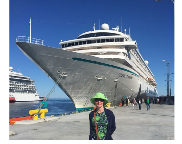
The luxurious Crystal Symphony sails through Scandinavia and St. Petersburg