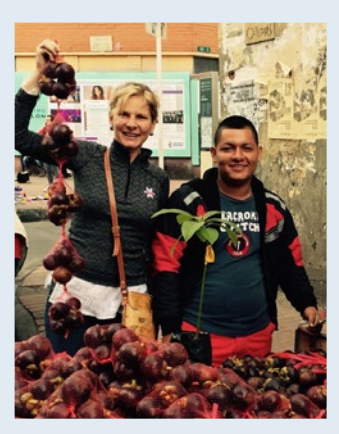
Purchasing perfect mangosteens from a street vendor in Bogotá, Colombia

Travelers are not just wanting to be served an amazing meal, they want to help cook it. Or even source it—whether that means shucking oysters with champagne in Australia, truffle-hunting with dogs in France or Italy, or being the first to meet the fishermen as they come into the market at 5:00am in Japan.