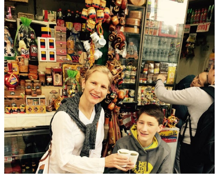
My son and I enjoy some Coca tea with a local vendor in Bogotá, Colombia

Colombia is incredibly sophisticated, organized, and clean, making it an enjoyable destination offering fascinating history, culture, nature and wildlife, and cities with spectacular gastronomy, shopping, and night-life. Even better, Colombia is still a great value, but that will inevitably change as word gets out!