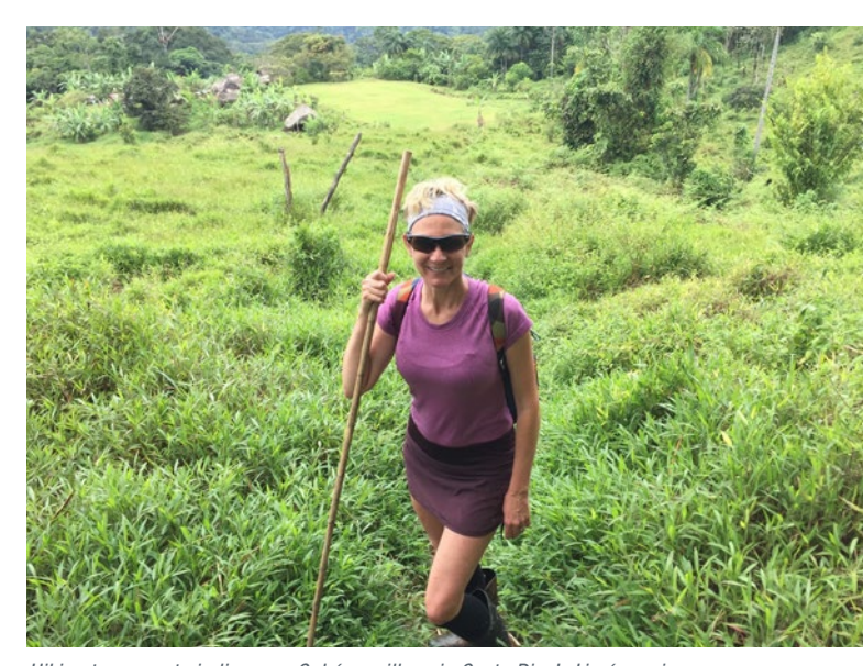
Hiking to a remote indigenous Cabécar village in Costa Rica's Limón region

We love Costa Rica and our favorite thing to do is organize seamless trips for families, romantics, and nature lovers to explore the "Pura Vida" in a comfortable and enriching way!