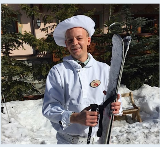
The ski attendants at Les Airelles in Courchevel, France make it all so effortless!

Les Airelles , a Five-Star Palace hotel in Courchevel 1850 in the French Alps — a warm and cozy alpine village retreat where the scent of local perfume, hand-painted murals, and the attentive, beret-clad bellmen are just a taste of what is to come!