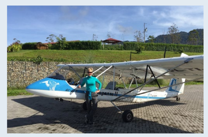
Ultra-lighting at AltaGracia is a thrilling way to see the Costa Rican countryside

Croatia, Slovenia and Montenegro in the Balkans, as well as Puglia and Basilicata in Southern Italy.