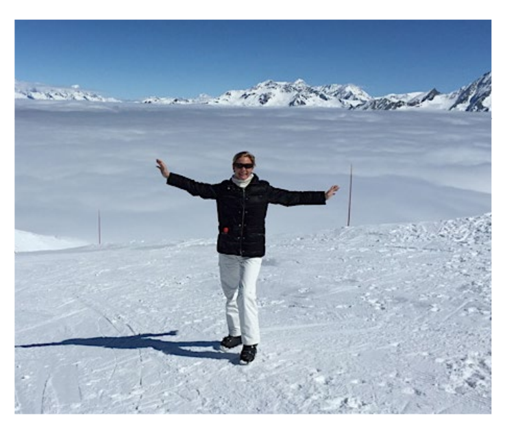
Skiing ABOVE the clouds in Courchevel, France

Food and beverage in Courchevel can seem obscenely expensive, but many of the luxury properties offer spectacular Michelin star "all-inclusive" meal plans — and you will want to dine on-property often anyway, so do book this in advance!