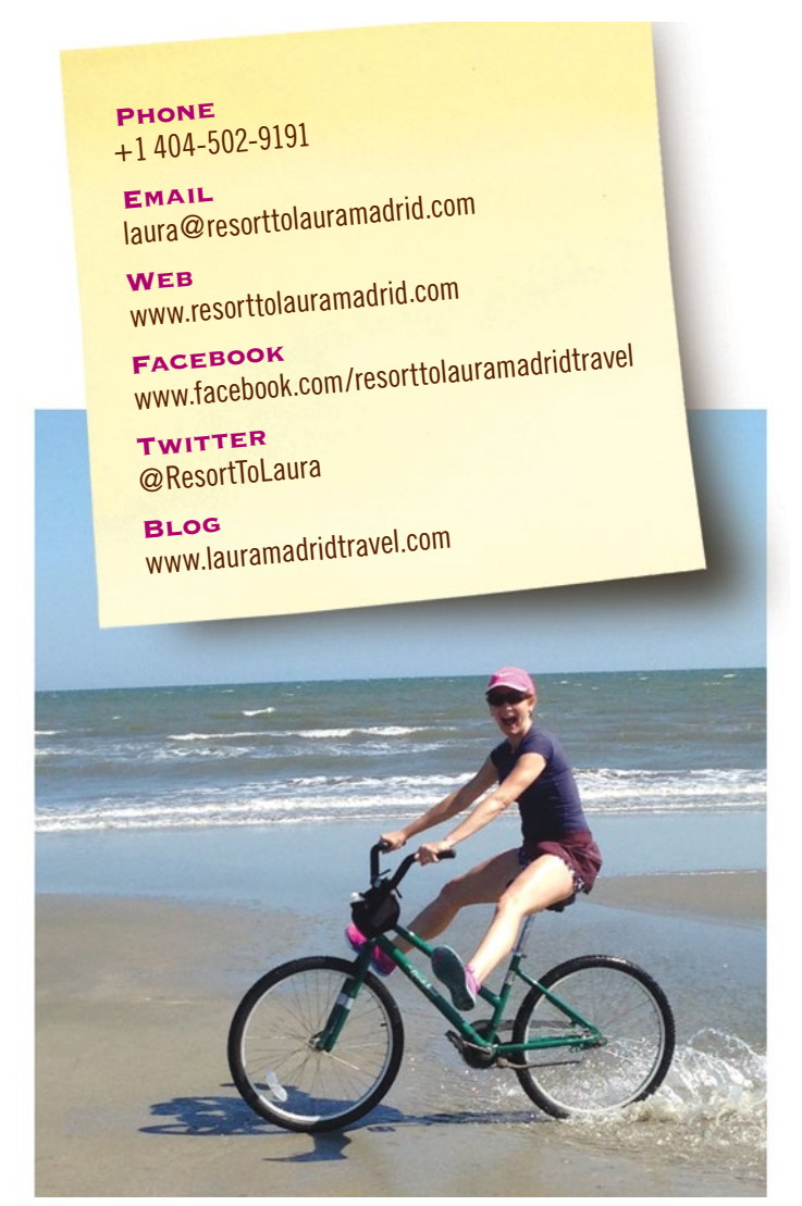
Cycling on the flawless beach at the Sanctuary at Kiawah, South Carolina

Let us map out your "Route de Bonheur" with Relais & Châteaux almost anywhere in the world — a wonderful way to stay in small, locally-owned properties where every detail counts!