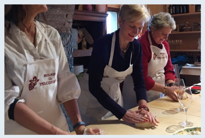
A cooking class (with wine, of course) at the Relais II Falconiere in Cortona, Italy

Dear Trusted Friends and Fellow Travelers,