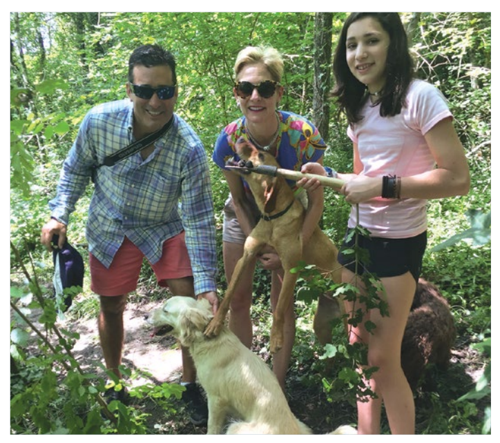
Istria, Croatia: My family enjoyed a private tour with a truffle hunter and his dogs

If you love Italy, then you are in for a treat in Croatia. Not yet on the Euro, Croatia is still a relative bargain with picturesque and preserved walled cities, islands, history, and absolutely incredible food and wine. Our family traveled by private car and driver, which I highly suggest to really maximize your stay, but the region can also be visited along the Adriatic in a fantastic ship, private yacht, or even by bike! Highlights included a private boat trip to Hvar, an exclusive oyster and mussel experience with a family in Ston, staying in a 7-room hotel in Diocletian's palace from 200 A.D. in Split, and swimming and dining at the chic Villa Dubrovnik. The people could not have been more welcoming and the history and diversity of cultures throughout the region are incredible. I can't wait to return!