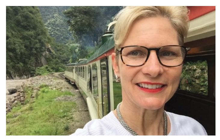
A selfie on the Inca Rail between Machu Picchu and Cuzco, Peru

a beach club, a toes-in-the-sand restaurant, a surf and activity shop, and miles of mountain cycling and hiking in the most pristine and relaxed environment. The town is pretty perfect, but unique in that you don't just see the snowbirds hunkering down for the weekend. Instead, the guests are a mix of school kids, year-round residents, and visitors alike. Las Catalinas encourages area "Ticos" to be a part of the Pura Vida lifestyle by enjoying the mountain biking and the local bar.