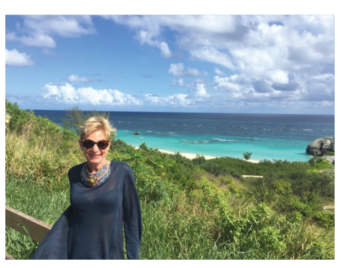
Bermuda: A perfect romantic getaway with so much to explore and experience

Imanta is the kind of place where the chef asks what you would like to eat and then prepares it for you. You are on a first-name basis with the beach bartender and he knows every type of margarita you have tried and that your favorite is the jalapeño hibiscus concoction. Your spa therapist meets you at the beach and walks you a few steps through the jungle to the al fresco treatment zone for a dreamy massage. You won't come home from this holiday in need of a vacation!