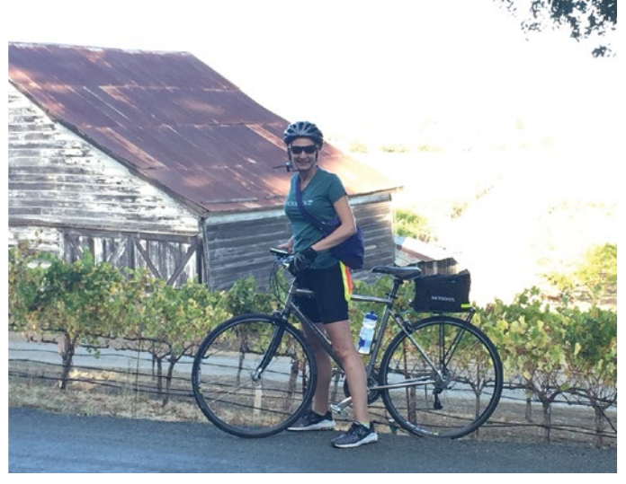
An idyllic barn shot during my Backroads cycling trip through Napa and Sonoma

Activities include phenomenal snorkeling and scuba diving, deep sea fishing, cliff jumping, caving, and horseback riding. This pristine British colony is merely a 2.5-hour flight from most U.S. East Coast cities and boasts six exceptional golf courses, tennis and terrific spas. While peak season runs May through October, Bermuda makes for a great off-season retreat as well, with spectacular rates available throughout the fall and mild winter (average temperature 65°F!). Can you say tennis team retreat, golf outing, or good old-fashioned birthday celebration with friends? Bermuda could not be more affordable or easier to get to for that quick fix during the U.S. winter months.