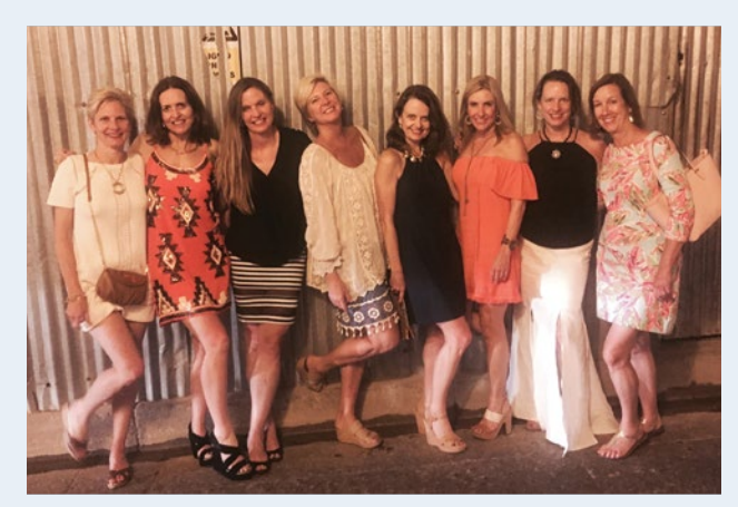
Cartagena, Colombia: An unforgettable girls' trip last February