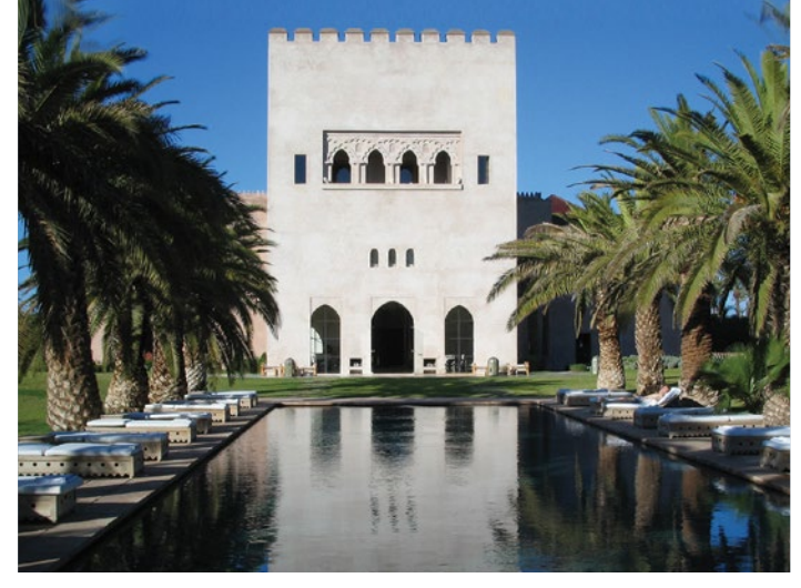
The magnificent Ksar Char-Bagh by Relais & Châteaux in Marrakesh