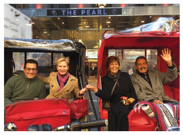
With my in-laws, riding around New York City on rickshaws

While we work closely with all of the larger and very glamorous properties including Four Seasons, Mandarin Oriental, Ritz-Carlton, Peninsula, St. Regis and so on, it is the tiny boutique gems that really take the most time to get to know. On this visit, I stayed at The Chatwal near Times Square and the Greenwich Hotel in Tribeca, but I did site inspections at The Surrey and the Lowell on the Upper East Side as well as the Crosby in SoHo. Let me know what you are seeking and I will help you select your perfect home away from home in Manhattan.