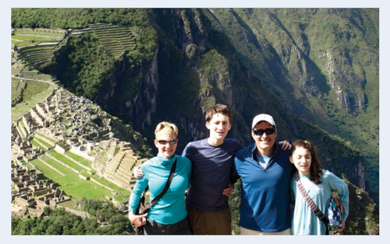
At Machu Picchu, hiking the Incan Trail in Peru with my husband and children

Make a family travel schedule for trips you want to take before your kids are out the door or hunkered down with their own school, work, or family commitments! Many of my clients realize that getting their children to break away from school priorities and sports, summer internships, and even their careers and day-to-day urgencies gets increasingly difficult. I encourage clients to have me sit down with them to review their travel wish list and actually schedule significant travel experiences for the next 2-5 years. This is a critical step in carving out time, expectations, and budget for taking these monumental trips before everyone gets too busy with their lives! My number one tip — send out the date to everyone you want there and tell them to lock it in on the calendar and steer around it, even if the trip details have yet to be completely ironed out.