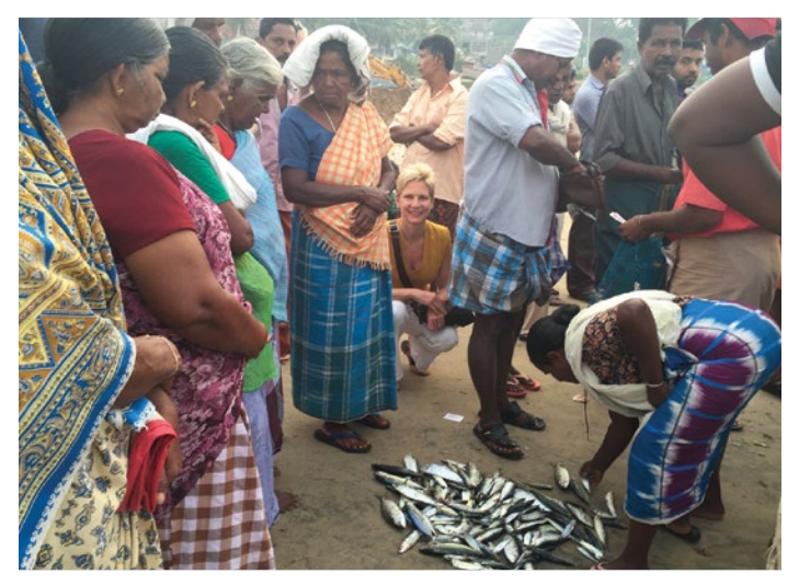
5:00am, Southern India: Local fisherman auction off their catch to the highest bidders

India is an incredible destination, and it makes for the most special ladies' trip! The culinary experiences, the shopping, the yoga, the cooking schools, the spa treatments — pure heaven! My mother and I indulged in Ayurveda whole-body healing systems, yoga, breath work, healthful and delicious and nourishing dining at Shreya's Retreat. We relished the history and shopping in Ft. Cochin in the trendy and relaxed Kerala region, and enjoyed beach time, cooking classes, and even a visit to a 5:00 am fish auction with our chef at the very southern tip of India.