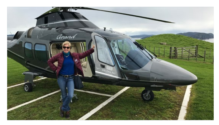
Helicoptering off from the uber-luxurious Helena Bay

Each year, I send many clients to the North and South Islands of New Zealand to explore beaches and mountains, quirky towns, the ancient Maori culture, breathtaking golf courses, and to boost their adrenaline: dart-boating, bungee jumping, hiking, fishing, kayaking, glacier climbing, heli-riding, and skiing. There are countless incredible, cozy lodges in which to unwind, each with bespoke service, staff, and setting to make you feel at home! NOTE: When I plan your New Zealand holiday, I need as much lead time as possible to get you into the most sought-after lodges in a nice flow from North to South or vice versa without much zigzagging. With less time, we may need to be more flexible on the routings. Either way, you will feel completely cared for. The gastronomic and wine options in New Zealand are very much worth the trip. Some consider New Zealand one big farm with spectacular beef and lamb dotting every hill, but the bountiful seafood and award-winning vineyards producing Sauvignon Blancs, Chardonnays, Pinot Gris, Pinot Noir and Shiraz (just to name a few) will keep you well-satiated throughout your journey!