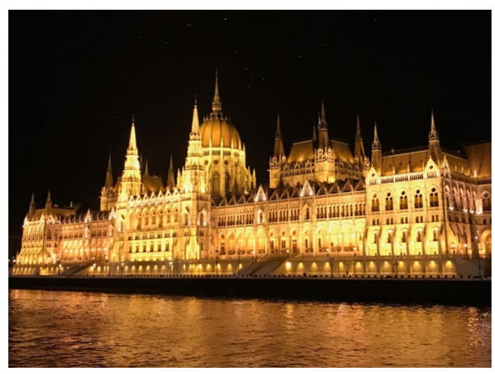
The Parliament in Budapest, shot from the deck of the Crystal Mozart along the Danube

I pulled together a group of dear friends for a week of cycling in the stunning Cascade mountains. We made our way from Bend to Crater Lake to Sisters , all the while taking in the majestic mountains, lakes, and deserts in between. The trip started with some wine-tasting fun in the Willamette Valley and ended with a night at the chic The Nines Hotel in Portland. It's just the ticket for those wanting something fresh that's close to home!