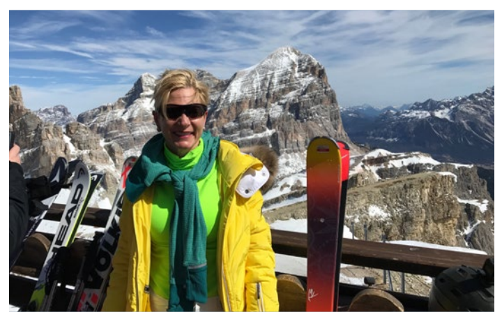
Skiing the Italian Dolomites

While the stunning Sella Ronda is a photo op "must" for experienced skiers, heading off-piste or from village to village is much more exciting. Alternatively, we can plan this trip during the summer, with a hut-to-hut hike through Italy's National Parks. Bellisimo!