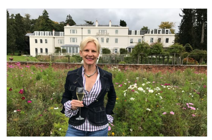
A bit of bubbly at Coworth Park in Ascot, England

A standard cruise on the Thames River can lull you to sleep. For families, I much prefer sightseeing on a fast-moving Rib Ride , which provides a beautiful, fun-filled hour of the prettiest sights on the Thames.