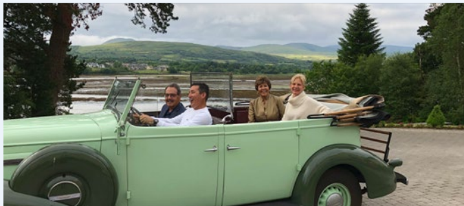
Driving through the Irish countryside in a vintage car

LAURA'S SOLUTION: New Zealand and Ireland both have magnificent golf, food and wine, luxury lodges, and manor houses that make for a perfect trip for a group of friends.