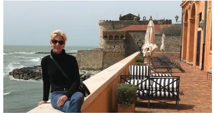
The Roman Seaside Resort, La Posta Vecchia

and three atolls, so deciding where to stay is no small feat. I can't say enough about the luxurious private island resort, Cayo Espanto , located just nine minutes away by private boat from the bustling town of San Pedro. Cayo Espanto is comprised of six one-bedroom villas and a single two-bedroom unit. Total occupancy is only 18 guests — an excellent option for those who are truly looking to ESCAPE and be pampered.