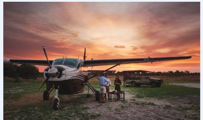
A safari is a favorite way for many of our clients to celebrate a milestone birthday

LAURA'S SOLUTION: Sri Lanka and the Maldives — Sri Lanka is off-the-charts special with wonderful lodges, tea plantations, coastal and highlands retreats where guests can experience great culture, nature and food and then easily retreat to a mind-blowing and idyllic island beach escape in the chic Maldives.