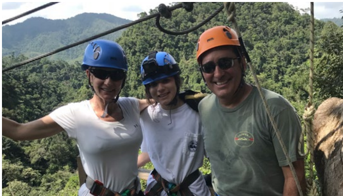
Ziplining in Belize with my husband and daughter — an incredible experience!

I have my favorite resorts focusing on “well-being” in the U.S., the Caribbean, Spain, Italy, Bali, India, and Thailand. Where do you want to be well? Let me know how I can help you reach your best self in 2019!