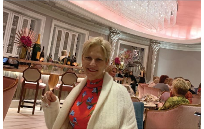
Rosé Champagne and oysters at Cammelias Ladies' Champagne Lounge at Hotel Bennett

The highly anticipated HOTEL BENNETT has arrived in high-style, and it has quickly made a name for itself. Everything about this distinguished hotel on historic Marion Square exudes indulgence, from the designer pedestal tubs to the luxury bedding. Still looking for more? King's Club accommodations offer exclusive VIP treatments, including dedicated concierge service and presentation throughout the day of the chef de cuisine's food and beverage creations. An enticing rooftop pool, several distinctive dining experiences, and a delightful spa keep guests well-entertained when they're not exploring charming Charleston.