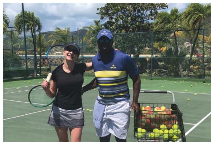
With my gracious tennis pro at Curtain Bluff, where the pristine courts are oceanside

HERMITAGE BAY is exclusive, relaxing, and completely chic, with the warmest, most engaging staff I have yet to encounter in the Caribbean. The views are breathtaking, the accommodations are downright sexy, the food is delectable, the wine selection is above and beyond, and the cocktails are made to impress. While Hermitage Bay is adults-only and unapologetically romantic, families with teens 16 and older are welcome to enjoy this boutique paradise, too.