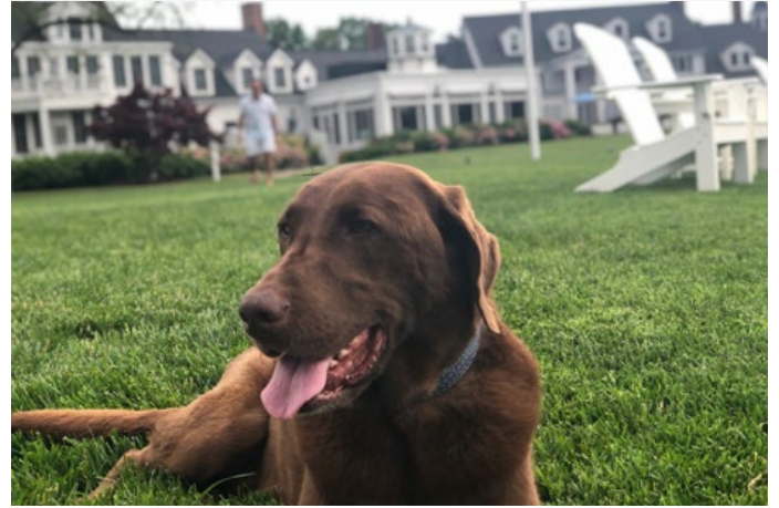
Porter and the other well-behaved canine guests approve of Perry Cabin!

Leisure activities abound: biking, croquet and bocce, kayaking and paddle boarding, tennis, swimming, fitness classes, and spa. The Links at Perry Cabin is a picturesque golf course well-suited to walk or play, but you haven't truly visited this corner of the country until you've spent an afternoon boating. The Inn at Perry Cabin has its own marina and a fleet of yachts for guests to enjoy daytime sailing excursions.