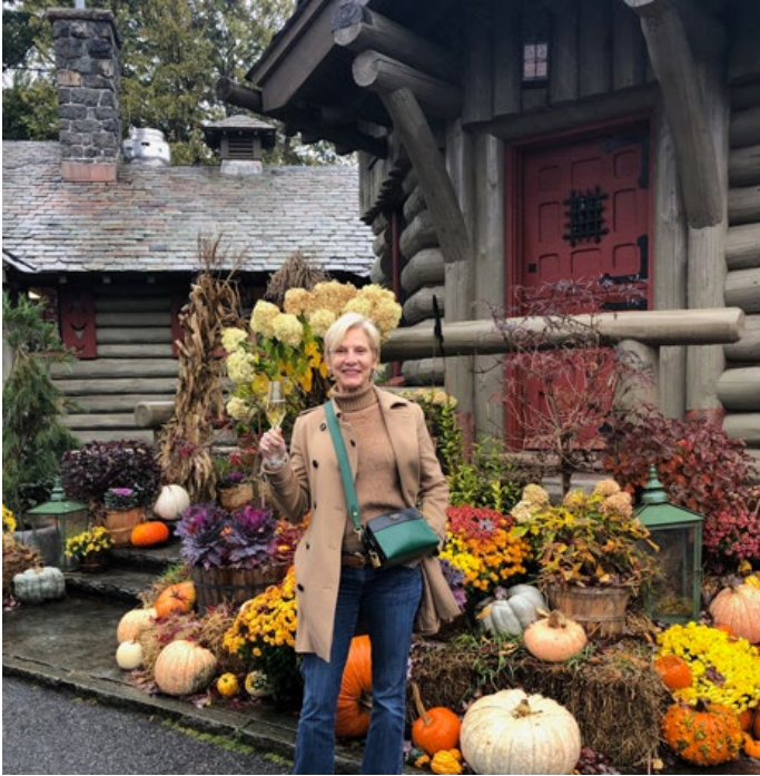
Adirondack rusticity, exquisite food and wine, and five-star service converge at The Point