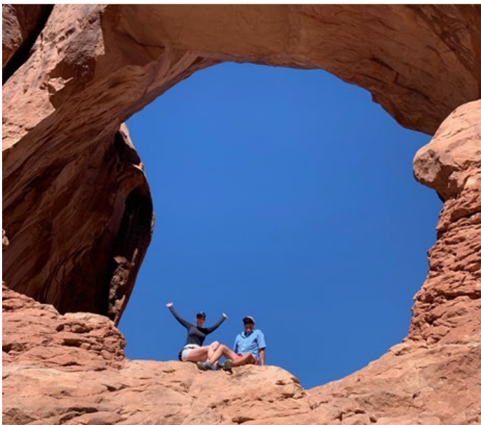
Arches National Park provides one idyllic photo opportunity after another.

This magical journey through Utah will be hard to beat, yet I am sure we will be back. There is still so much we have yet to see, and after any time spent there, it's clear that America truly IS the beautiful!