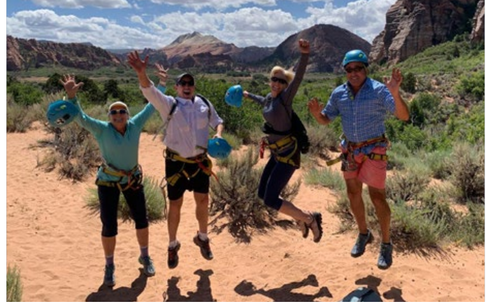
Great travel companions can really make an adventure fun!

Utah's National Parks have got to be some of America's most beautiful treasures! With a landscape lifted straight out of a daydream, each of Utah's five National Parks offer mind-blowing geological formations and more active adventuring than even the most rigid of schedulers could fit into a week. Nonetheless, we toured Zion, Bryce, Arches, and Canyonlands (sorry, Capitol Reef, but you are a reason to return!). Even car rides through this part of the country are a spectacular sight.