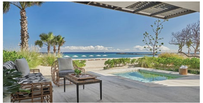
A gorgeous sunset over the fabulous Four Seasons Resort Los Cabos at Las Palmas

Four Seasons Hotels and Resorts has been notorious around the globe in identifying and creating destinations, so it's no surprise they took the lead in anchoring Costa Palmas, an exclusive new development featuring world-class golf, a huge yacht marina, a private airstrip, and multi-million dollar homes. (An Aman resort is also under construction in the area). Located an hour north of the airport on the virgin Sea of Cortez on the East Cape, the Four Seasons Resort Los Cabos at Costa Palmas is the ultimate place to easily retreat and be socially distant — huge rooms and suites, multiple pools for seclusion, and miles of soft white sandy beaches. With tennis, golf, basketball, spa, fitness, and of course, flawless dining and service that exceed your expectations, couples and families could not find a better escape to nourish the soul and soak in the warmth of Mexico than this exquisite property. Four Seasons has set the standard worldwide for taking care of both guests and employees safely during COVID-19. I can highly recommend Four Seasons Resort Los Cabos at Las Palmas.