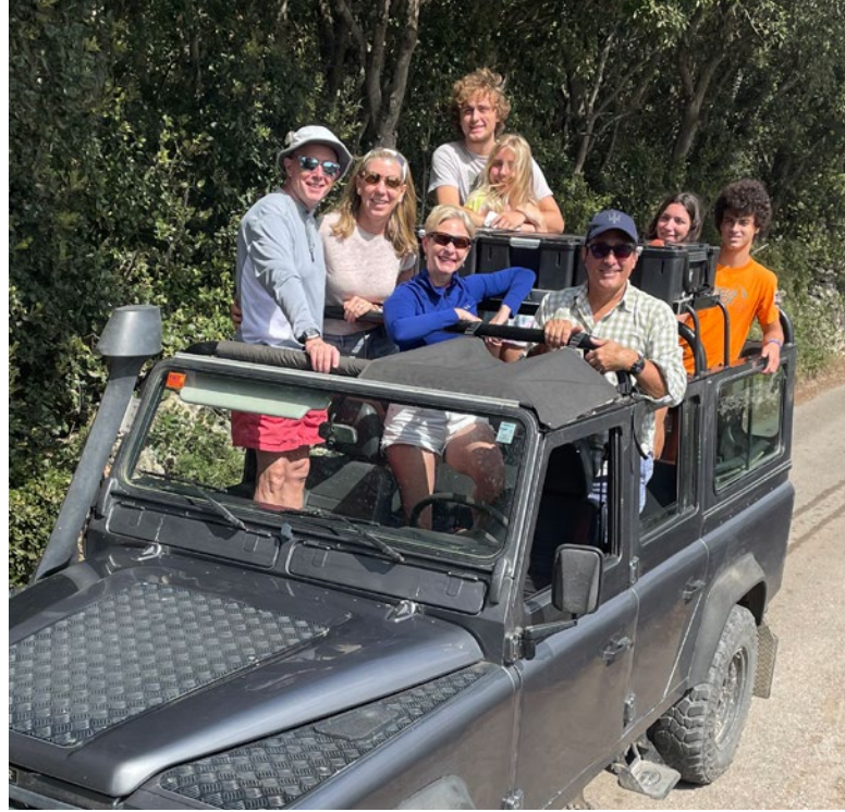
A SPECTACULAR SPANISH SUMMER! Clockwise from top left: Our driver in Madrid let me take the wheel on his 1989 Mini Cooper; A 4x4 Jeep safari tour of Menorca with a terrific local guide; A never-ending field of sunflowers in Costa Brava; About to enter the #1 restaurant in the world, El Cellar de Can Roca in Girona; and the stunning Binigaus Nou boutique villa in Menorca.