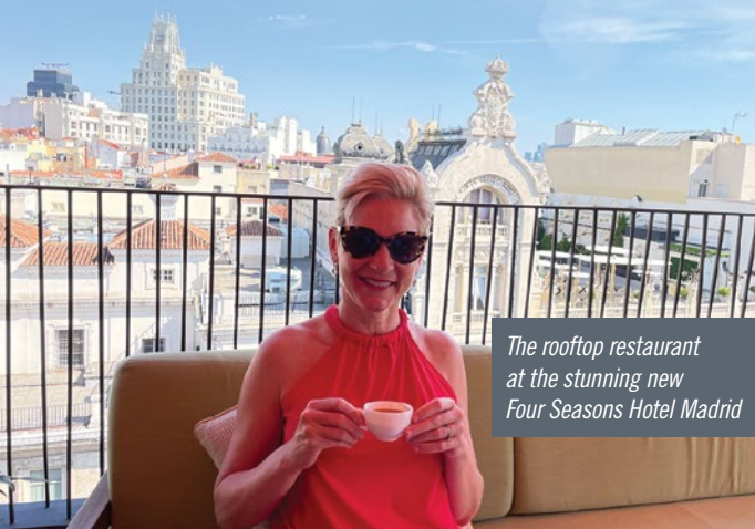
The rooftop restaurant at the stunning new Four Seasons Hotel Madrid