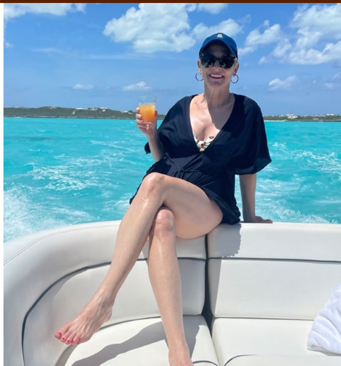
Enjoying the good life in Turks & Caicos on a chartered yacht