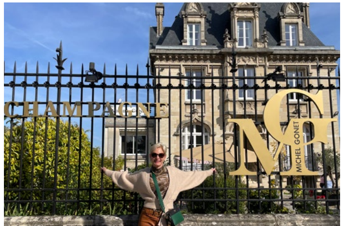
Walking the sparkling UNESCO-protected Avenue of Champagne

LAURA'S TIP: Champagne is not just an apéritif or meant to be pulled out only for celebrations. In Champagne, this effervescent liquid gold is enjoyed every day and with all meals!