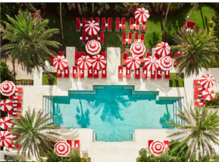
Just steps away from the ocean is the phenomenal Faena Miami Beach

Faena Miami Beach is a cultural outpost of art, fashion, theatre and gastronomy, and offers so much more than a hotel stay. Glamorous indeed, the striking decor with an abundance of red in the fabrics, furnishings, and art makes quite a statement. Faena is close to but just north of the hustle and bustle of South Beach, in its own more sophisticated universe.