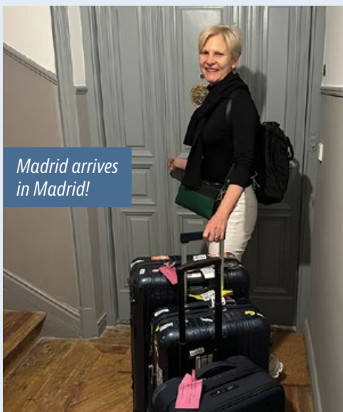
Madrid arrives in Madrid!