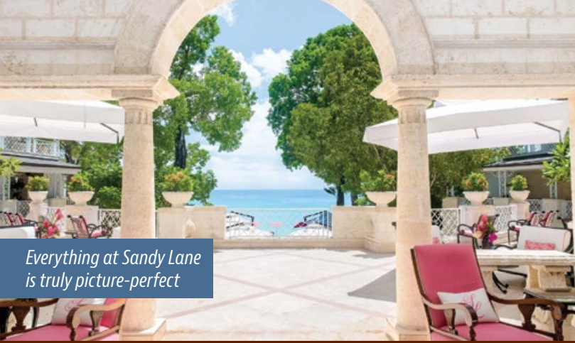
Everything at Sandy Lane is truly picture-perfect