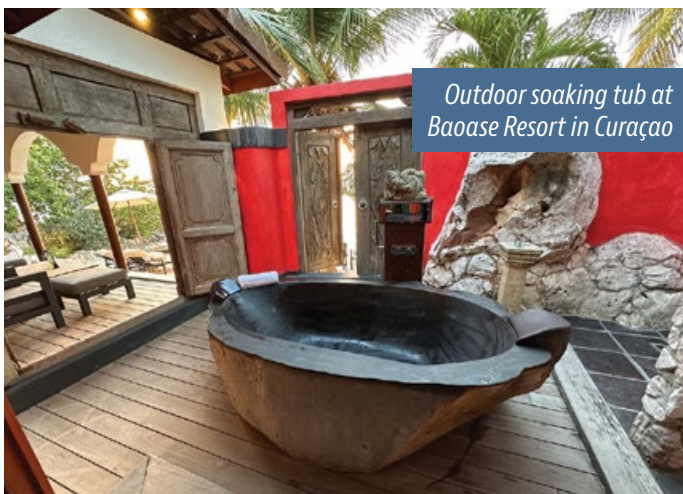
Outdoor soaking tub at Baoase Resort in Curaçao

Aruba is known for some of the prettiest beaches in the world and here I visited two properties: the adults-only and wonderful family-run Bucutti and Tara resort and the sparkling Ritz-Carlton Aruba Resort & Casino . Easy puddle-jumper flights are offered between islands, making the ABC's a perfect archipelago from which to island-hop.