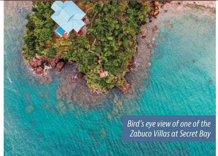
Bird's eye view of one of the Zabuco Villas at Secret Bay