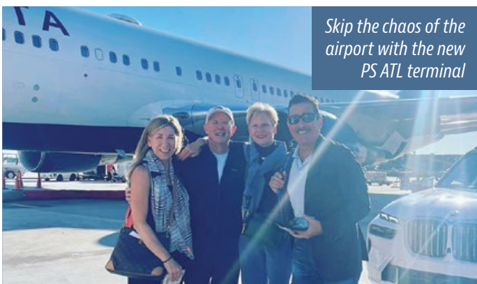
Skip the chaos of the airport with the new PS ATL terminal

Enjoy the benefits of a private plane travel while flying commercially! This year, Hartsfield-Jackson Atlanta International Airport welcomed a new private terminal for travelers who want to escape the chaos of the airport. The most VIP way through ATL isn’t at ATL at all, but via a separate terminal on the far side of the runway. RTLM can get you there seamlessly in style—contact me for membership types and check out the video on social media of my recent PS Suite Experience on my way to Spain. ▶