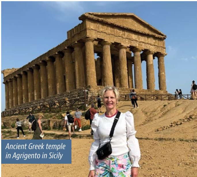
Ancient Greek temple in Agrigento in Sicily

Palermo stretches along a beautiful bay on the Tyrrhenian Sea. I was enchanted by the city's wide boulevards, traditional Sicilian Old Quarter, Baroque palaces, and mouthwatering delicacies at every turn. Discover history, majesty, and serenity at Villa Igiea , a turn-of-the-century palazzo on the Gulf of Palermo. Part of the Rocco Forte collection, it is a long-loved seaside-meets-city sanctuary for royalty, dignitaries, and Hollywood luminaries.