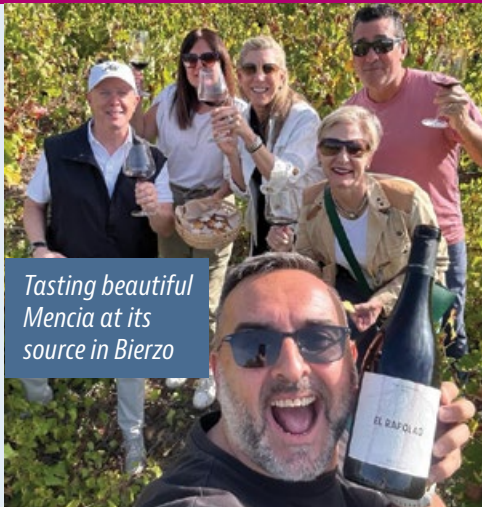
Tasting beautiful Mencia at its source in Bierzo

From historic towns to top gastronomic experiences to its vibrant culture and colorful traditions, I would love to help you get off the beaten path to explore the richness of Spain's mountains, islands, coasts, and cities.