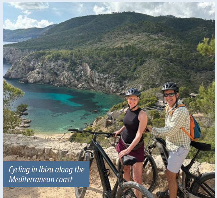
Cycling in Ibiza along the Mediterranean coast

Just off the coast of Spain, Ibiza is known for its vibrant nightlife and iconic nightclubs that attract top DJs and electronic music artists from around the world. The Northern part of the island, however, offers private and peaceful coves and bays, tranquility, and a free-spirited, artsy vibe. This is where Six Senses Ibiza has opened in recent years, attracting a whole new clientele to this Balearic island. Located just 35 minutes from the airport, the resort is tucked away on Ibiza’s secluded northern tip, capturing its authentic sense of community, spirituality, and celebration.