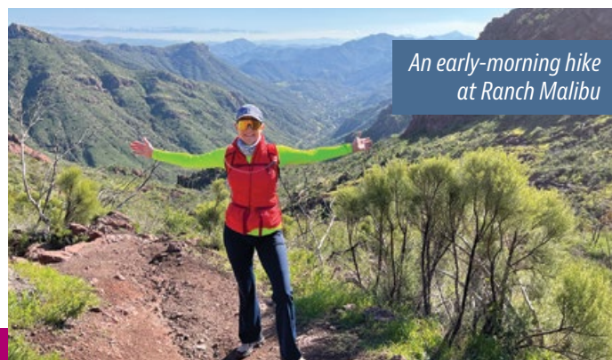
An early-morning hike at Ranch Malibu

If you are seeking a getaway with lasting benefits, this retreat delivers sustainable results through a strict, results-oriented, no-nonsense, "no-options" philosophy. Among an intimate group of up to 25 guests, the highly knowledgeable staff tends to your every need while guiding you to achieve your personal physical and mental goals. Those who read my blog know that I don't sugarcoat anything, so I'll be honest: a week at Ranch Malibu is brutal, but highly rewarding. The repeat guest ratio here is off the charts, if that tells you anything!