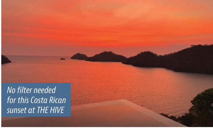
No filter needed for this Costa Rican sunset at THE HIVE