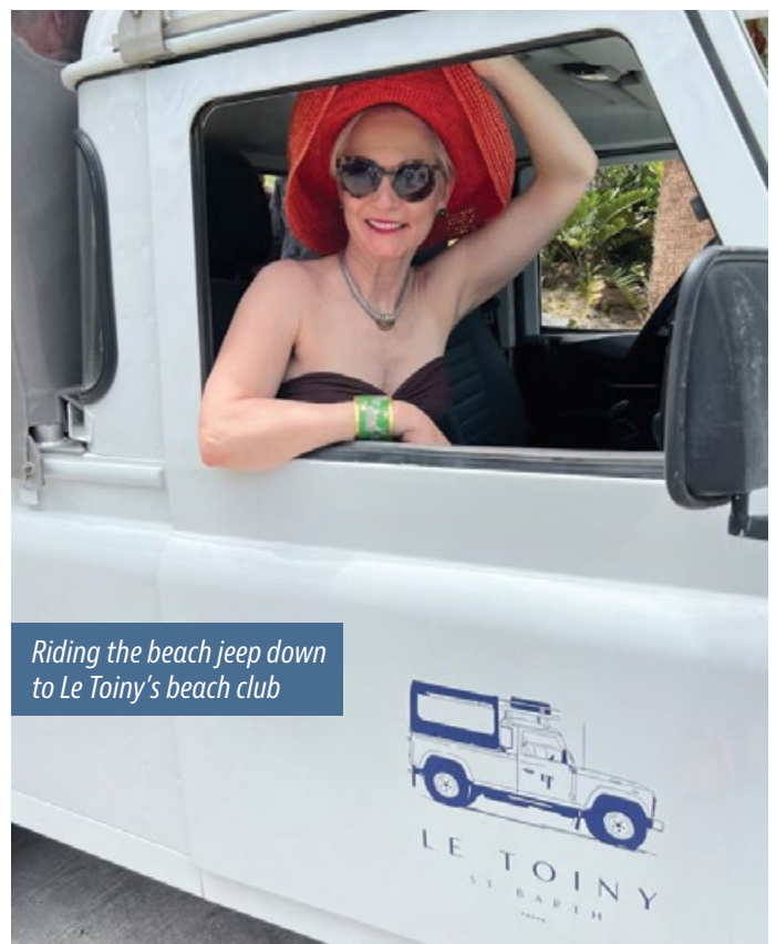
Riding the beach jeep down to Le Toiny's beach club