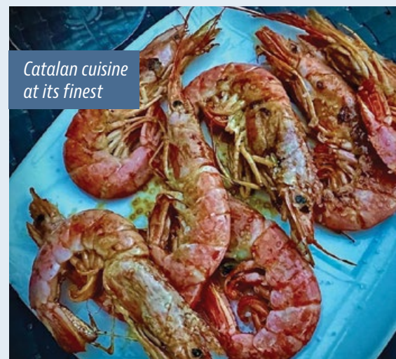
Catalan cuisine at its finest