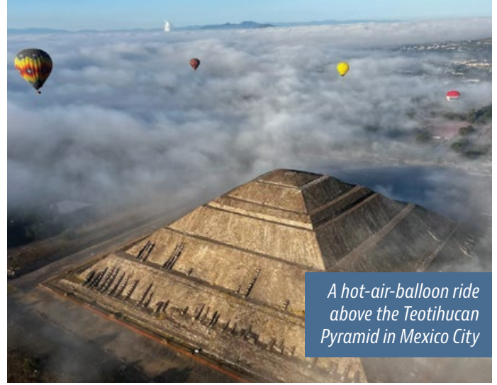
A hot-air-balloon ride above the Teotihuacan Pyramid in Mexico City