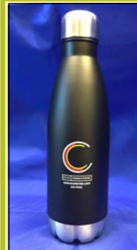
Water Bottle Sponsored by ACHD COMMUTERIDE