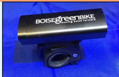
Bicycle Light Sponsored by Boise Green Bike