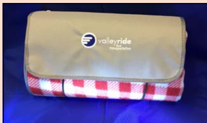
Picnic Blanket Tote Sponsored by Valley Ride