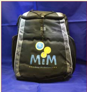
Backpack Cooler Sponsored by May in Motion