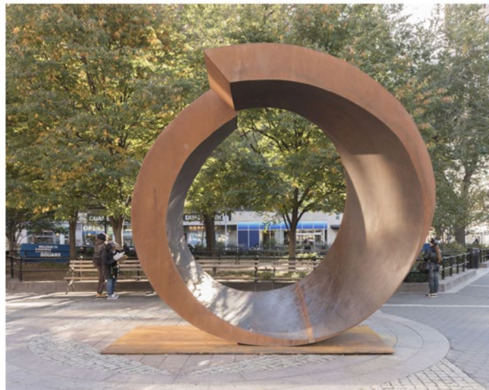
Beverly Pepper, My Circle .