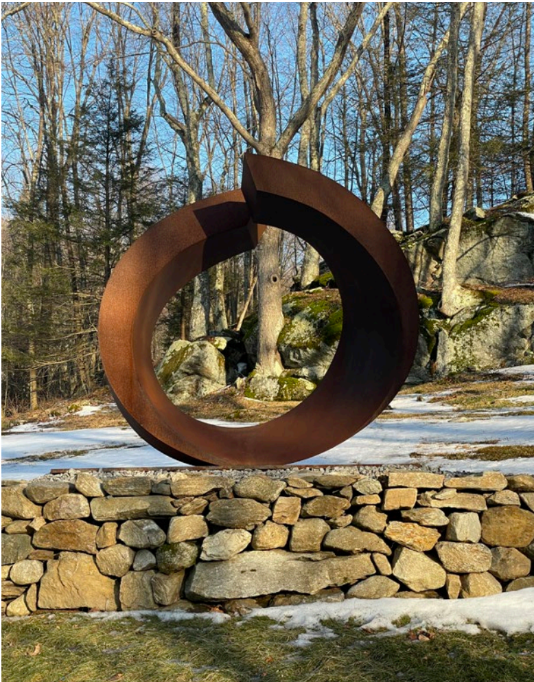
My Circle , 2008-2018 Placed in an important private collection, United States