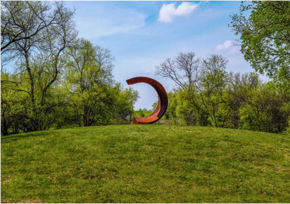
Octavia , 2014-2018 Museum of the Shenandoah Valley Winchester, Virginia