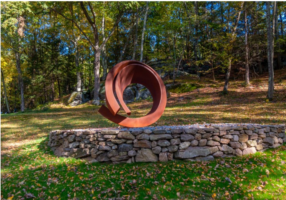
Clodia Medea , 2014-2018

Placed in an important private collection, United States