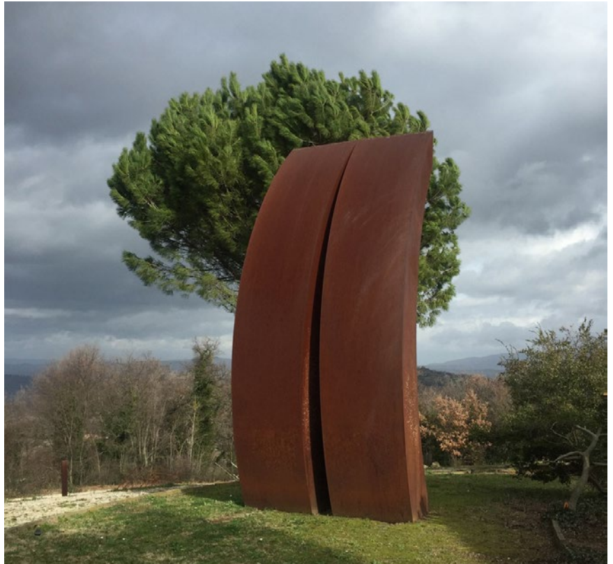
Longo Monolith, 2008

Placed at the US Consulate in Milan for their new building designed by SHoP Architects, to be installed upon completion of construction.