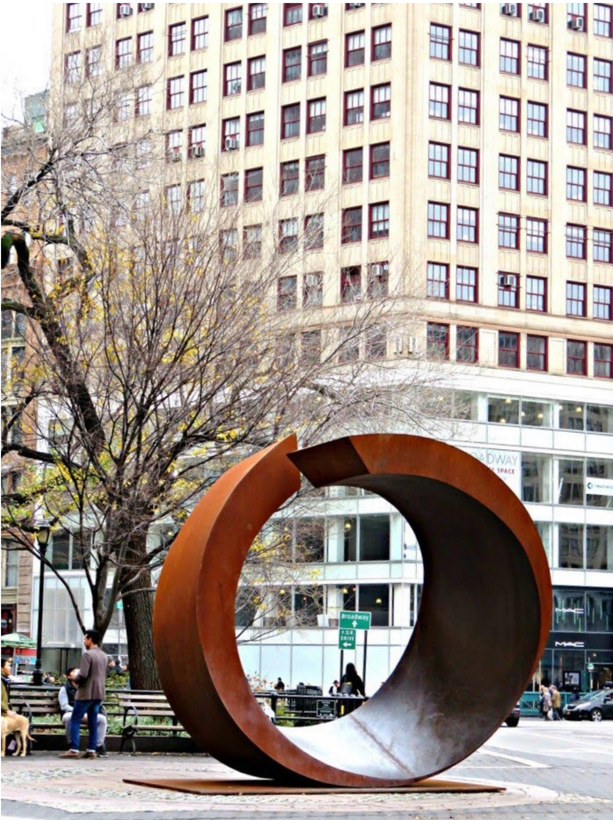
A fourteen-foot tall variation of My Circle was previously installed in Union Square, New York from October 2015 through May 2016 to celebrate Pepper's 93rd birthday.