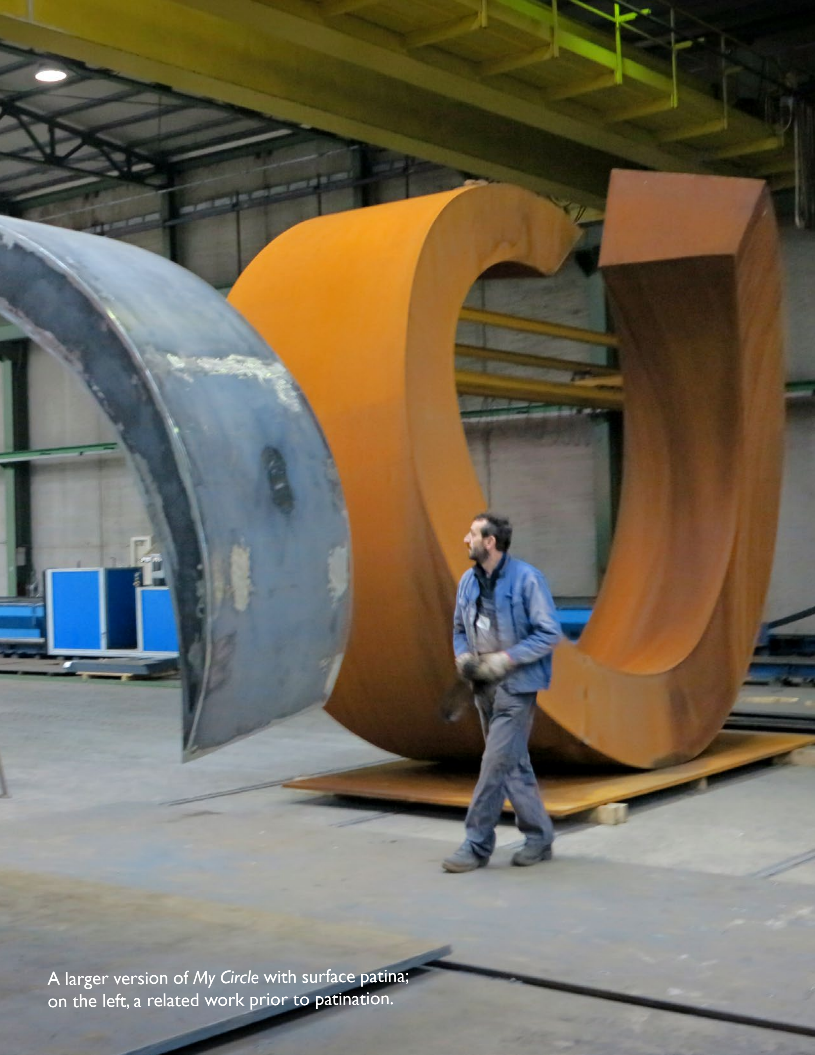
A larger version of My Circle with surface patina; on the left, a related work prior to patination.