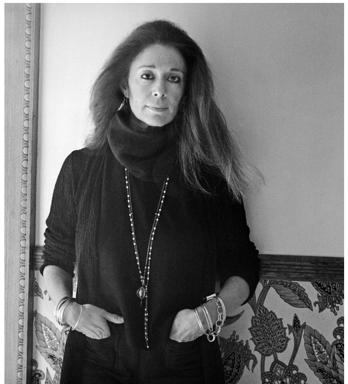
Jorie Graham, photo © Jeannette Montgomery Barron

“ My Circle is a circle from one point of view, but when you see it from the side, it breaks completely. It’s as if it’s a circle pulling itself into a circle, but also pulling away from being a circle.”