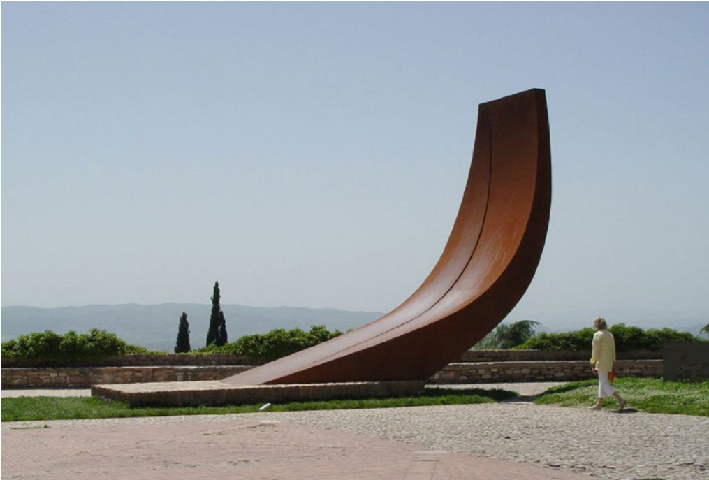
Ascensione , 2008 Piazza San Pietro, Assisi, Italy

Pepper's late Cor-Ten works have been widely collected. Selected public and private collections include: