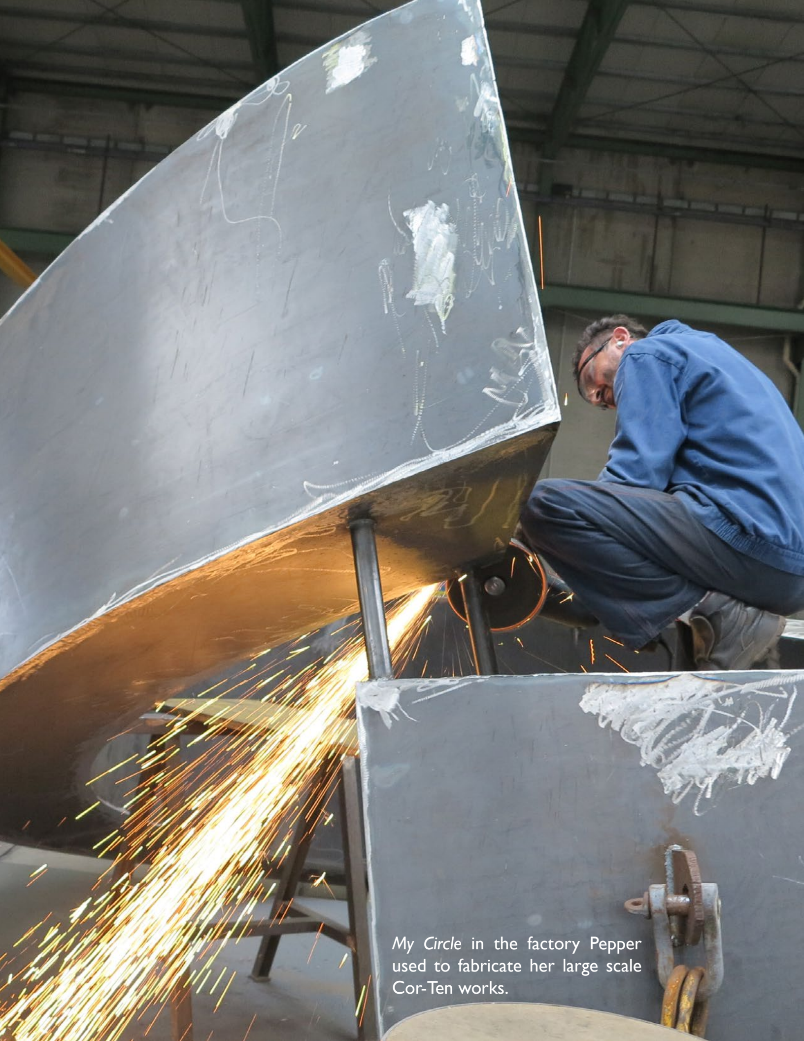
My Circle in the factory Pepper used to fabricate her large scale Cor-Ten works.