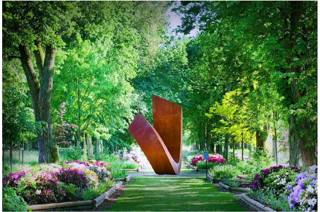
My Twist , 2008 Muni au Château de Vullierens, Switzerland