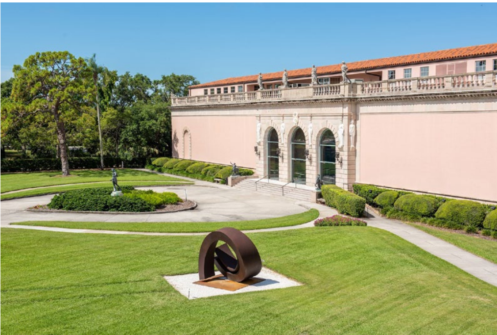
Curvae in Curvae , 2012 Ringling Museum of Art, Sarasota, Florida