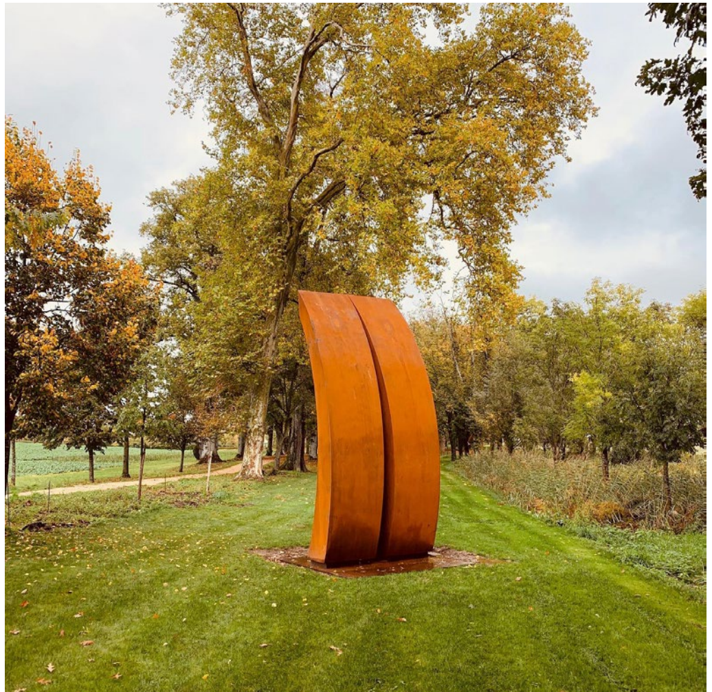
Longo Monolith , 2008 Muni au Château de Vullierens, Switzerland