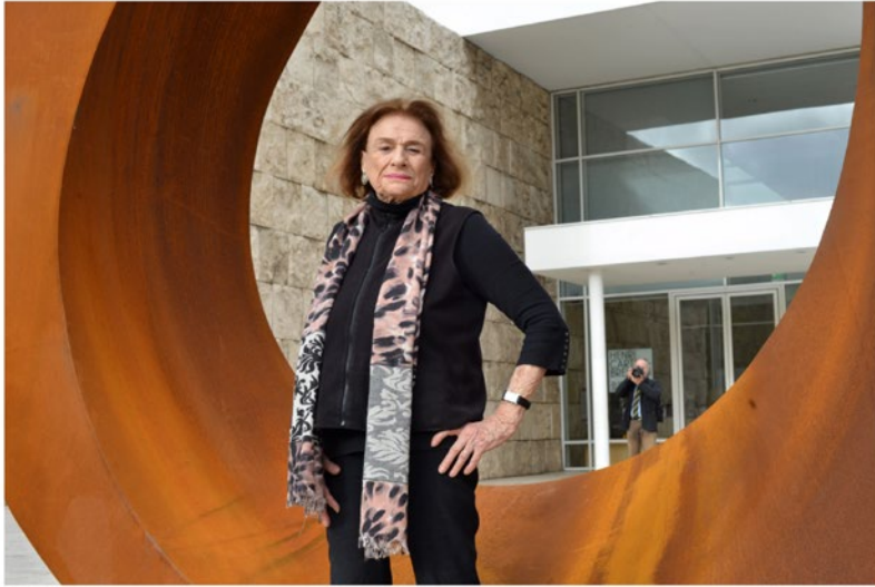
Beverly Pepper.