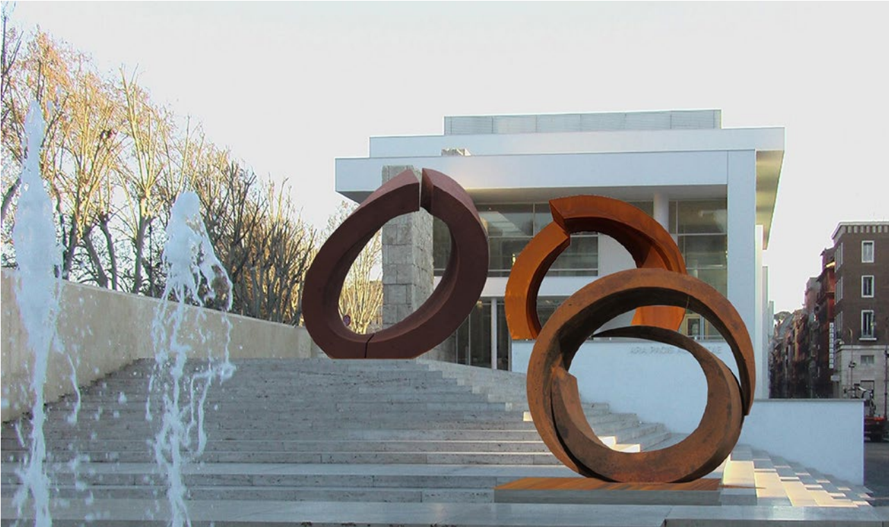
The Ara Pacis Museum in Rome; My Circle is the work closest to the building.

A variation of My Circle was previously exhibited at the Ara Pacis Museum in Rome in Beverly Pepper all'Ara Pacis . The 2014 exhibition marked the first time that sculpture was installed on the steps of the Richard Meier-designed museum, and it attracted significant attention. In addition to three monumental Cor-Ten works, the exhibition included tabletop sculptures inside the museum, which Pepper often created as precursors to the large-scale outdoor works.