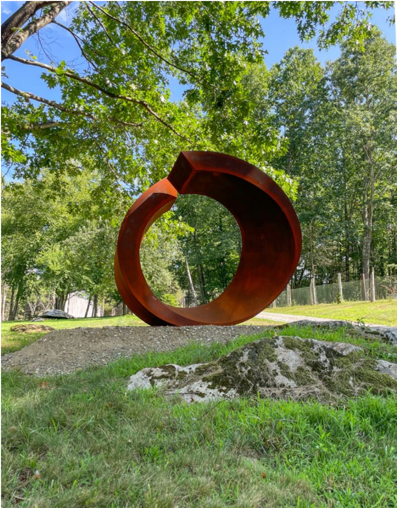
My Circle , 2008-2022

Placed in an important private collection, United States