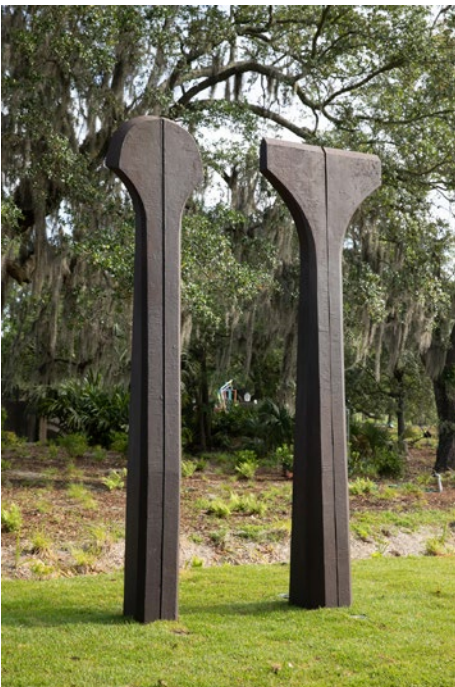
Split Ritual II , 1996 Sydney and Walda Besthoff Sculpture Garden New Orleans Museum of Art, New Orleans, LA

In 2020, the US Consulate in Milan acquired Longo Monolith (2008) for their new building designed by SHoP Architects, to be installed upon completion of construction.