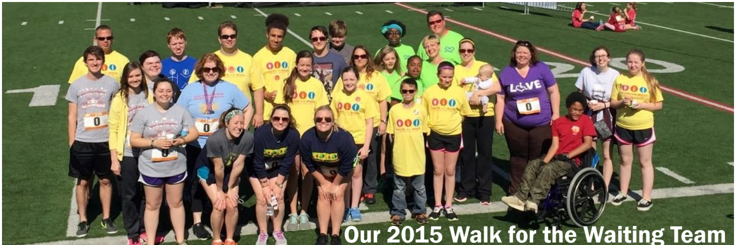
Our 2015 Walk for the Waiting Team

You can help by joining or supporting our Lakewood UMC team in the fourth annual Walk for the Waiting -- a passionate collaboration between Project Zero, Immerse Arkansas and The CALL -- on Saturday, April 30 at 9 am in War Memorial Stadium. Go to www.walkforthewaiting.org/LakewoodUMC to pledge your support or sign up for the short, fun walk.