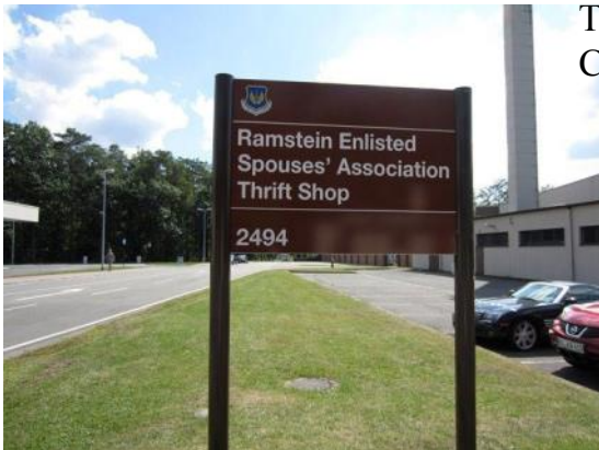
Ramstein AFB, Building 2494

The RESA Thrift Shop is owned and operated by RESA. Earnings from the Thrift Shop provide funding for all events and welfare requests.