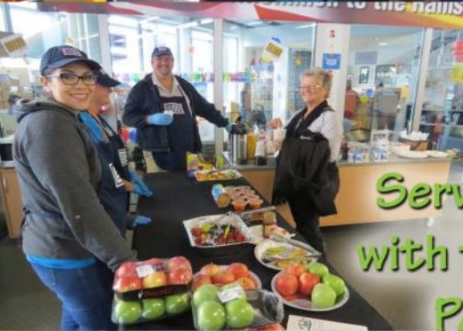
Serving Breakfast with the USO at the PAX Terminal