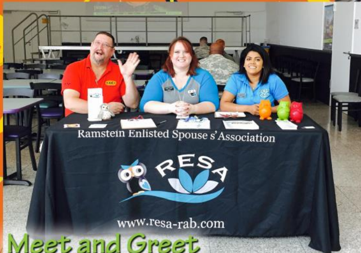
Meet and Greet