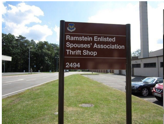
Ramstein AFB, Building 2494

The RESA Thrift Shop is owned and operated by RESA.